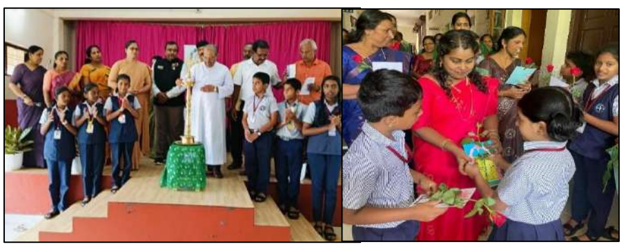
work of our teachers, and each teacher was given a gift and lunch.

songs, the national anthem, 'Bharathamba,' were held.