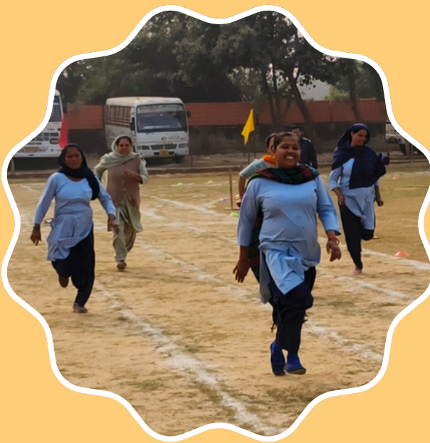
Winner (Male) 100 Meter Race