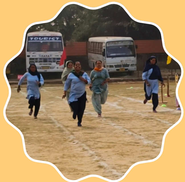
Winner (Female) 100 Meter Race