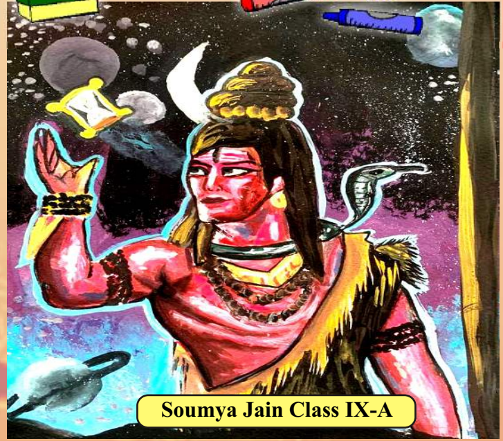
Soumya Jain Class IX-A