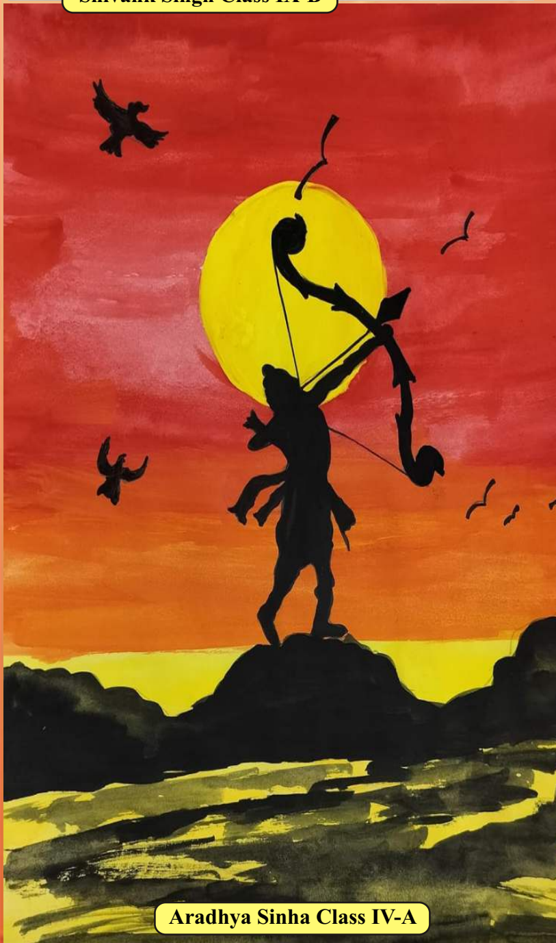
Aradhya Sinha Class IV-A