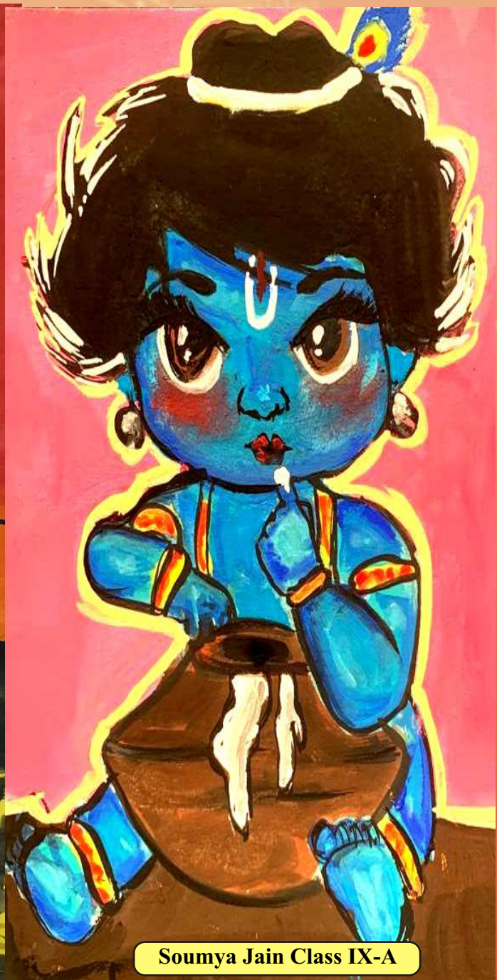
Soumya Jain Class IX-A