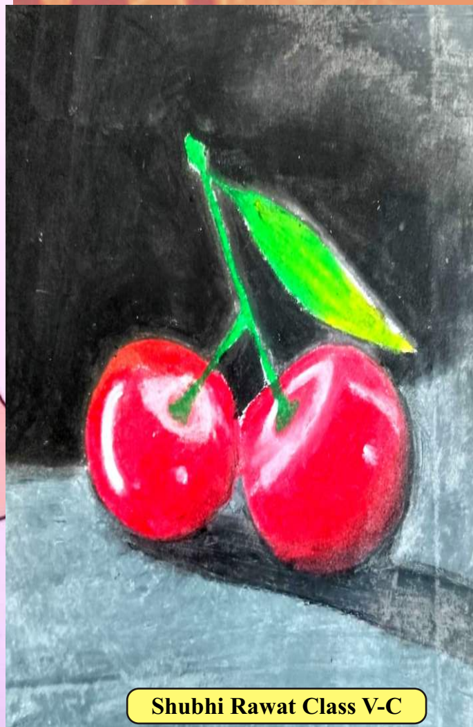
Shubhi Rawat Class V-C