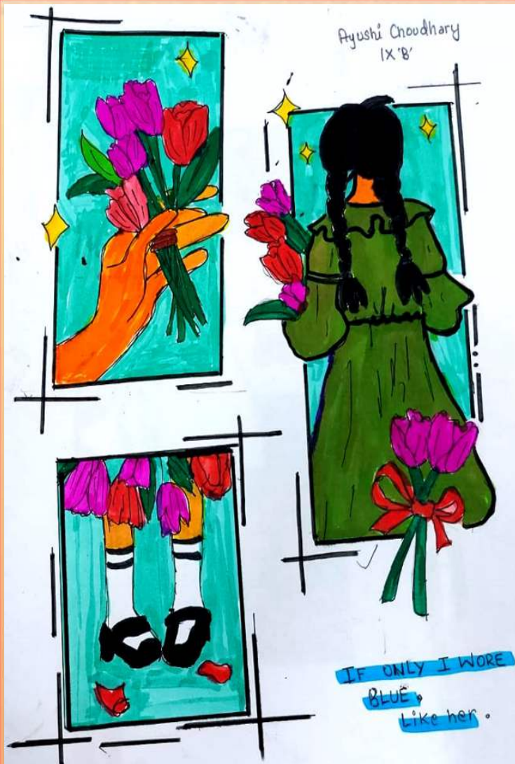
Ayushi Chaudhary Class IX-B