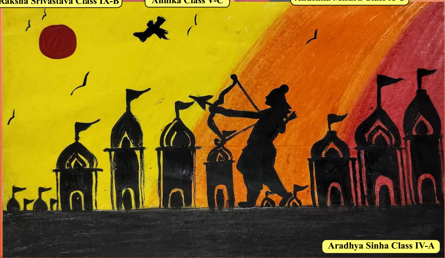
Aradhya Sinha Class IV-A