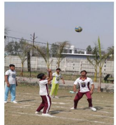
Physical Activities for developing physical health.