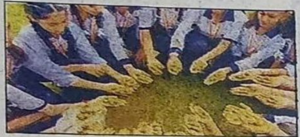
Participants prepared 6,000 seed balls in five days