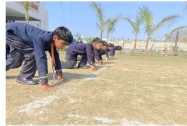
Physical Activities for developing physical health.

At Goswami's Mom's Pride School, recreational activities play a vital role in shaping well-rounded, happy, and successful individuals.