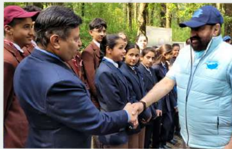
LPS Golf Team Meets Honourable Governor (Lt. Gen. Gurmit Singh) of Uttarakhand