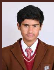
PRINCE S. BATHYAL SCHOOL GAMES CAPT.