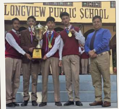
Team LPS wins Runner Up Governor's Cup Interschool Golf Tournament