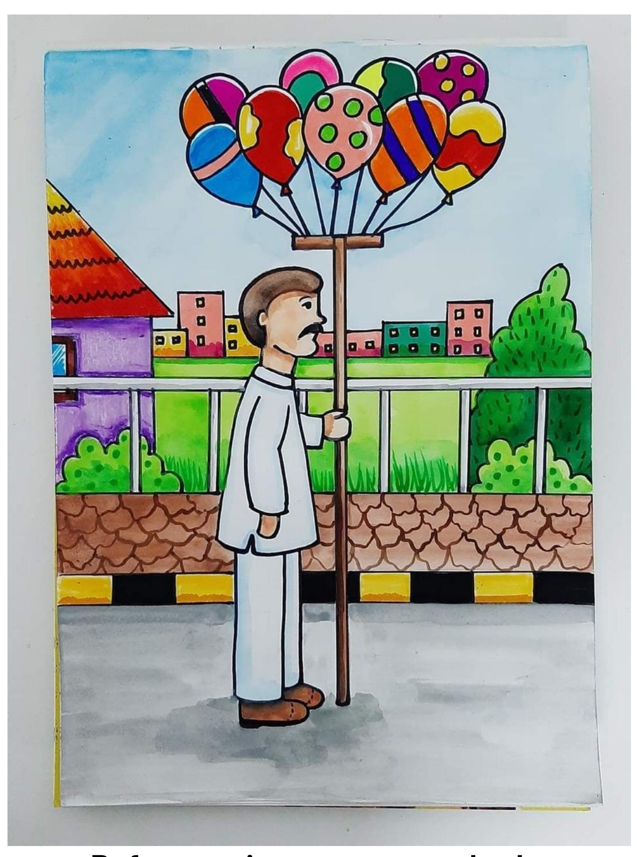
Reference image are attached