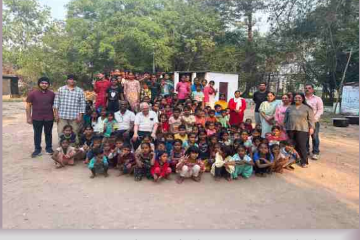
'Roti Bank Project' was launched by the Interact and Social Justice Club to reinforce the idea that there should be food in everyone's plate.