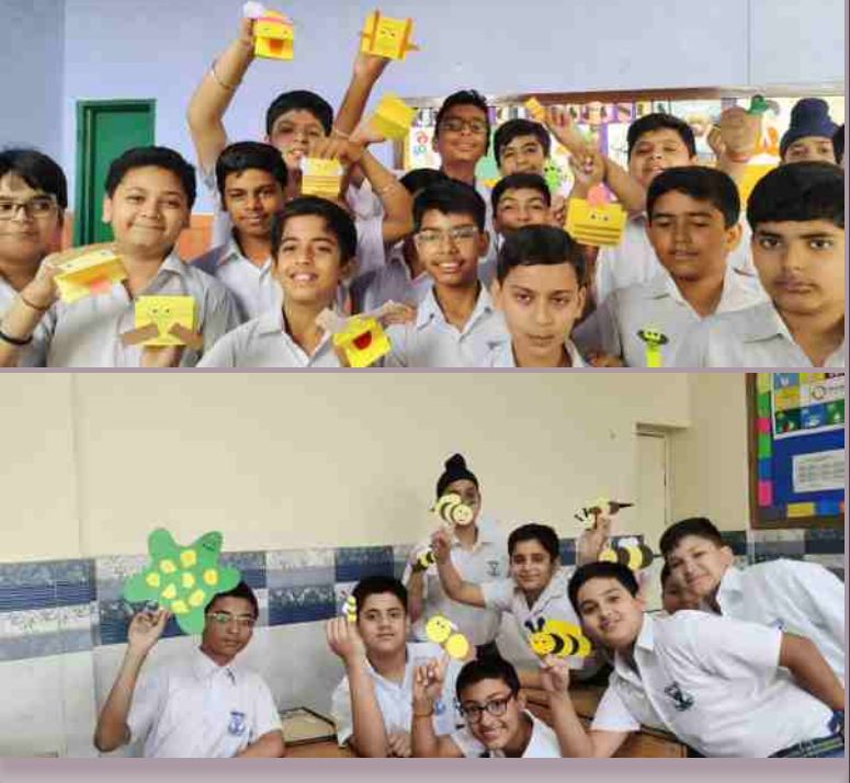
Eco club of our school organised an activity in HPE period to celebrate 'World Bee Day'and 'World Turtle Day.'