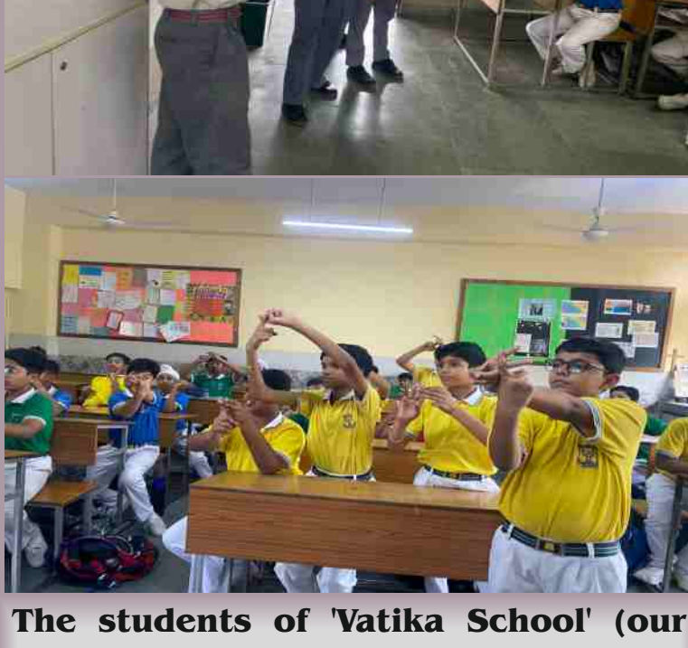
The students of 'Vatika School' (our outreach partner) along with their teacher visited our school and taught our class 6 boys English alphabets in their Sign Language.