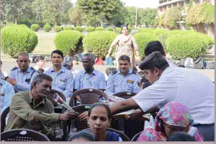
On the occasion of Labour Day on 1 May 2024, the students of class 10-B conducted an assembly to recognise the exemplary services of our Grade IV employees.