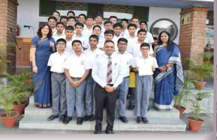
The boys of class 8-C conducted the morning assembly on the occasion of 'World Health Day' emphasizing the significance of physical, mental and oral hygiene.