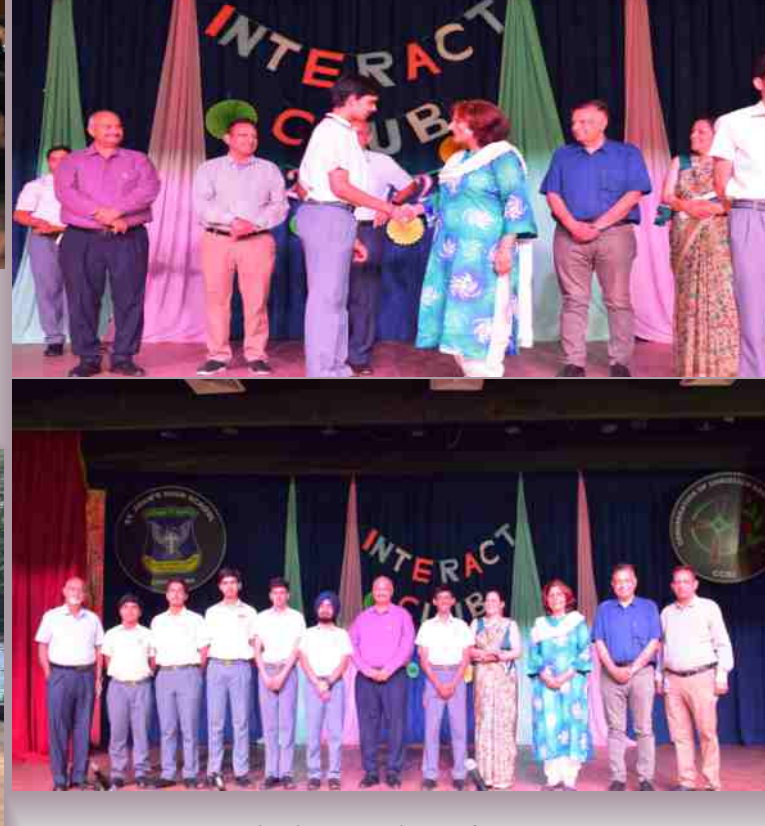
Interact Club Induction Ceremony took place on 14th May '2024 wherein the newly installed Interact Club members were invested with their badges and responsibilities.