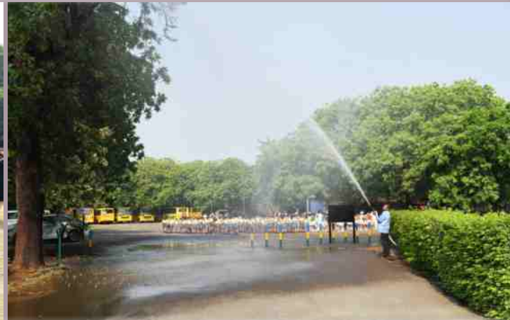
A comprehensive Disaster Management Drill was organised to ensure preparedness for potential emergencies. Emergency response teams demonstrated the fire extinguisher operation and first aid administration to create a safe and secure environment for the entire school community.