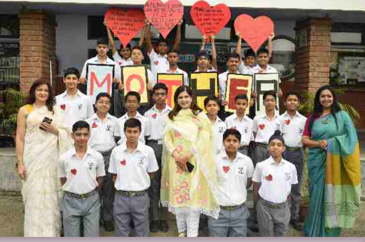
Class 8-A boys expressed their love and gratitude towards their mothers during their class assembly on the topic 'Mother's Day'.