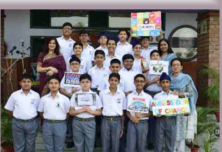
A morning assembly on the topic 'Earth Day' organised by class 7-B and Eco Club boys was an eye opener for all the young Johnians. The boys highlighted the harmful effects of plastic pollution and how to live our lives responsibly. The theme for this year was Planet v/s Plastic.