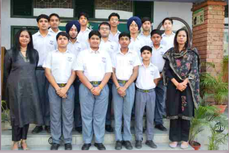
Students of class 9-A conducted an assembly on the topic 'Resilience and its benefits in our lives.'