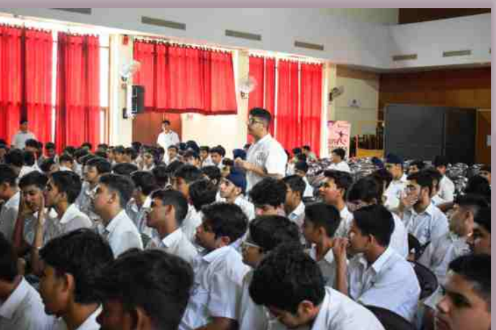
Students of class 10 had an introductory session with their outreach partner, SARVANI and apprised themselves with the working of the institution.