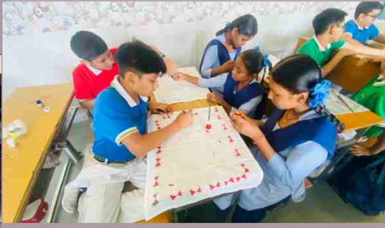
Class 7 students had a very innovative Fabric Painting activity with the students of Government Middle School, Sec-26, Chandigarh - their outreach partner.