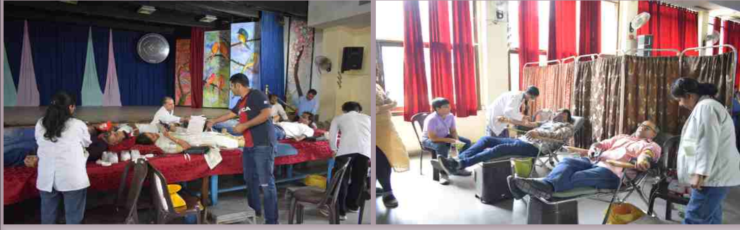
On 11th May 2024, parents as well as the staff members of St John's High School enthusiastically participated in the Blood Donation Camp organised by the Blood Bank Society, Chandigarh.