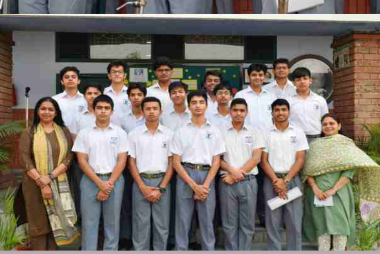
On the occasion of Rabindranath Tagore Jayanti, students of class 10-C conducted an informative assembly paying tribute to the illustrious Bengal writer, honouring his life and accomplishments.