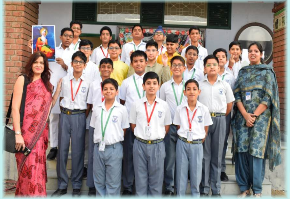
The students of class 6-A conveyed a meaningful message through their class assembly that 'No matter what, everyone deserves a second chance in life.'