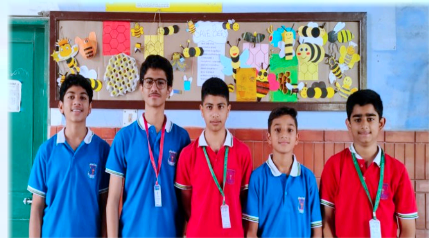
World Bee Day 2025