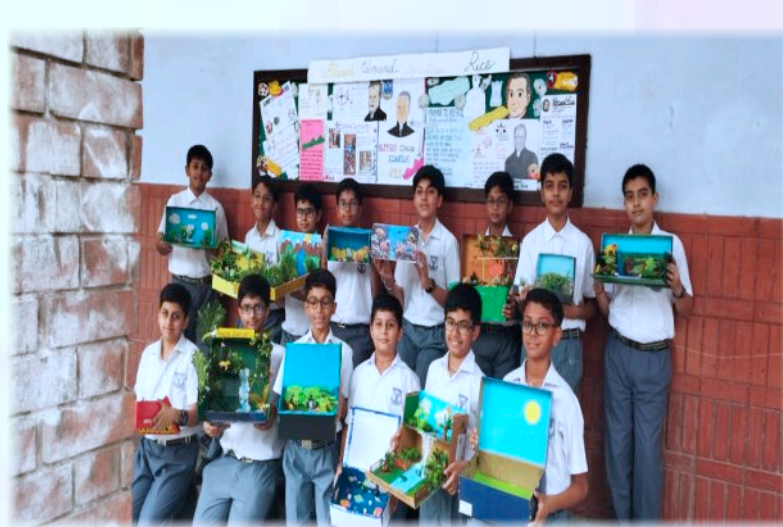
CLASS 8D CONDUCTED AN ASSEMBLY ON BR. EDMUND RICE'S FEAST DAY. THROUGH SPEECHES, A POEM AND A VISUAL PRESENTATION, STUDENTS HIGHLIGHTED HIS LIFE, VALUES AND MISSION. THE ASSEMBLY INSPIRED REFLECTION ON COMPASSION, SERVICE AND RESILIENCE, LEAVING A MEANINGFUL IMPACT ON ALL PRESENT.