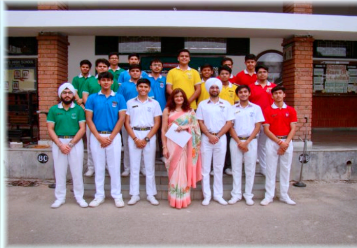
AN ASSEMBLY WAS HELD TO INTRODUCE THE STUDENT COUNCIL TO CLASSES 6 TO 8. MEMBERS WERE PRESENTED AND THEIR ROLES EXPLAINED, PROMOTING LEADERSHIP AND RESPONSIBILITY.