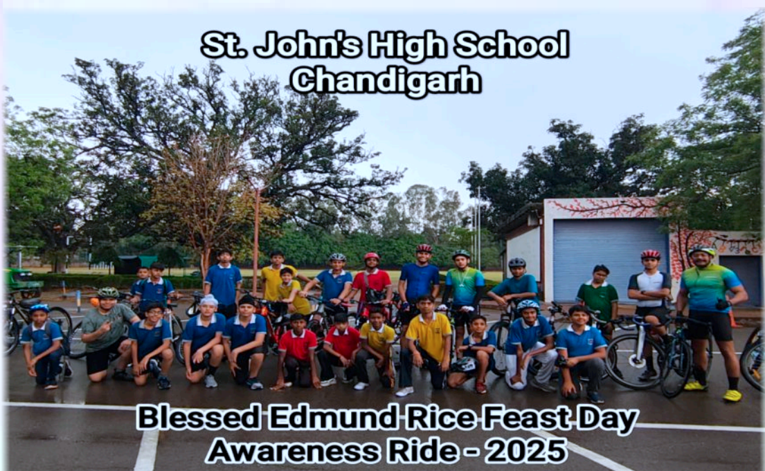
Blessed Edmund Rice Feast Day Awareness Ride - 2025