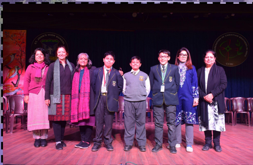
St. John's High School Chandigarh