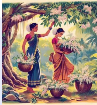
Women plucking flowers