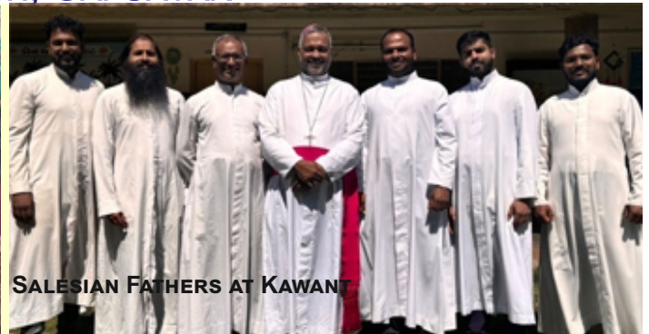
SALESIAN FATHERS AT KAWANT