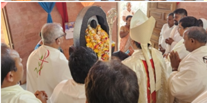
↑ FEBRUARY 12 – KORVI MELO FEBRUARY 11 – GAY SAVAR MELO ➡