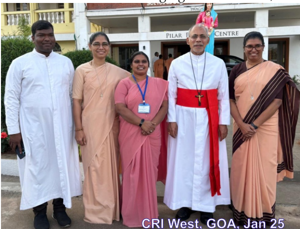
CRI West, GOA, Jan 25

The Pune workshop offered valuable insights into the integration of wellness within religious life and raised greater awareness about the services provided by the St. Dymphna Institute. (patron saint of the mentally challenged). The CRI Western Region also announced its plans for future collaborations with CMHM, aiming to extend wellness programmes to those in formation and congregation members, thereby reinforcing its commitment to the holistic well-being of religious.