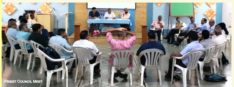
PRIEST COUNCIL MEET

Every issue has two sides or perhaps even eight or more. It is a challenge for us to reflect on in the current Church-World situation, both ad intra and ad extra .