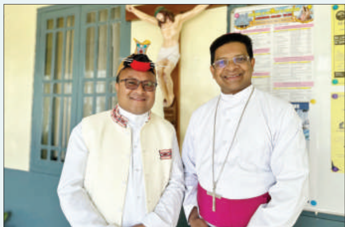
Catholic leaders of Shillong Archdiocese.