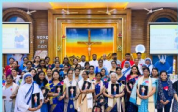
Nurses Day Celebration, Malviya Nagar