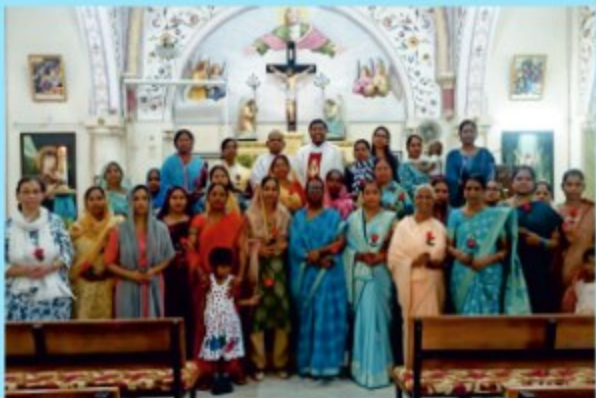
Mothers Day and Nurses Day Celebration, Ghat Gate