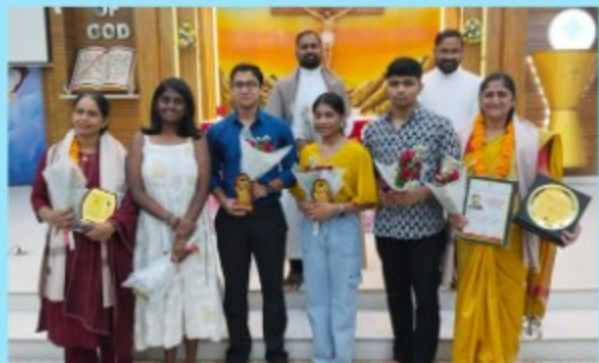
Academic Toppers Award-Class X and XII, Malviya Nagar