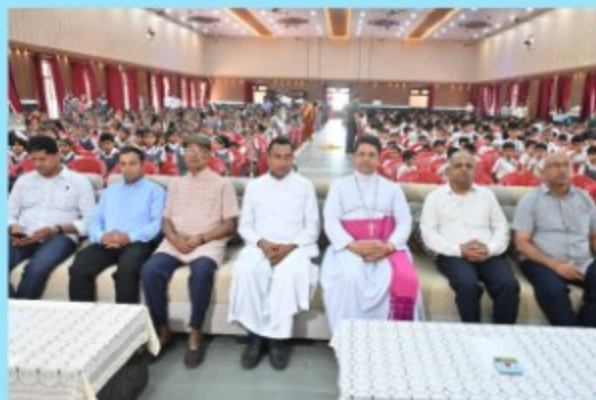
Blessing and Inauguration of the New School Block and Auditorium, Chomu