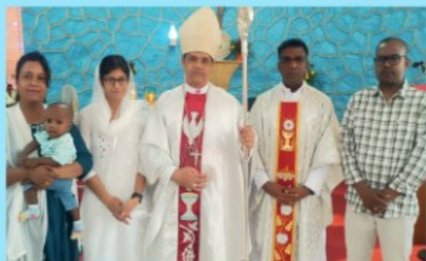
Pastoral Visit, Confirmation and Church Feast, Dausa