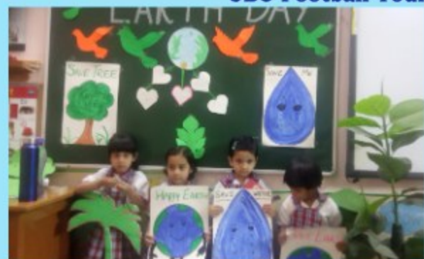
Earth Day Celebration - St Mary's Convent School, Jagatpura