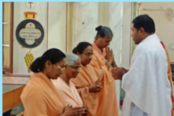
Farewell to MSA Sisters, Ghat Gate