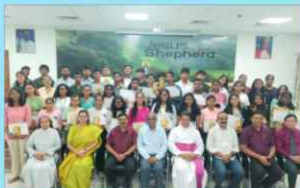
Board Exams : Achievers, High Accolades - by JCF