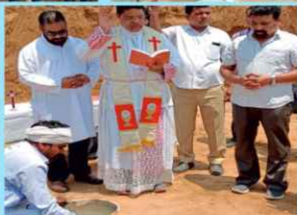
Blessing of Foundation Stone - St Anselm School, Lalsot