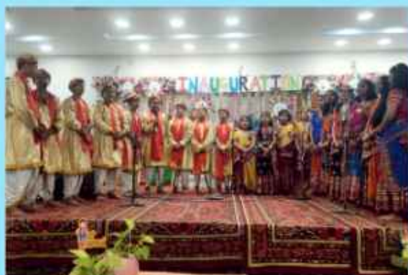
Blessing and Inauguration - St Anselm Kindergarten, Alwar