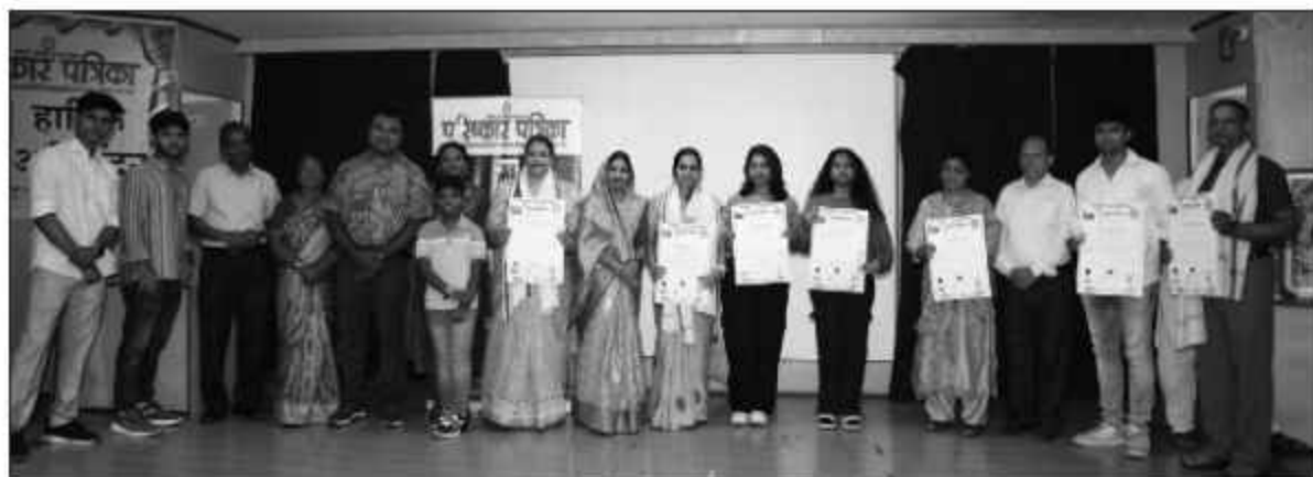
Parishkar Patrika honouring meritorious students and their teachers