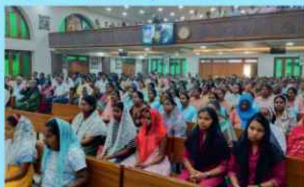
Laity Sunday Celebration, Malviya Nagar