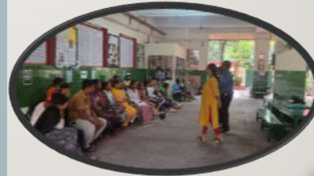
Monthly parents meeting