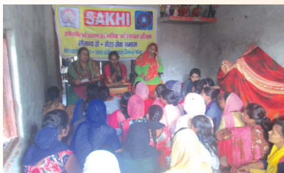
Training on menstrual system and sanitation