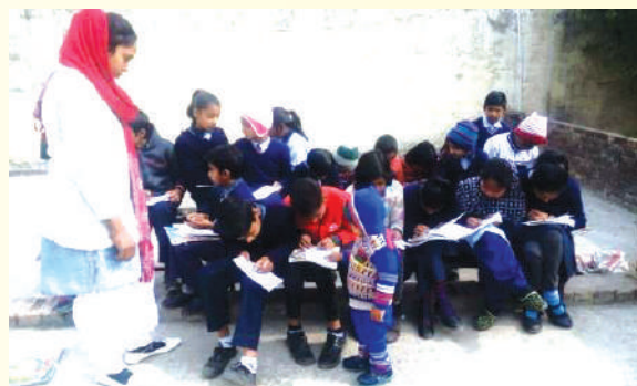
Masti Ki Kaksha for children

Masti-ki-kaksha: This is a fun learning activity and we teach children that disposal of garbage must be done in the garbage bins only, teeth cleaning and hand wash is also practiced in this activity. In year 2019–20, total 150 Masti-ki-kaksha have been done till the month of March 2020, in which 3000 children took part.