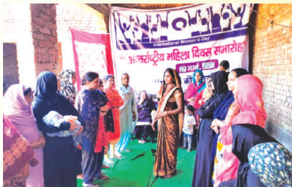
International Women's Day celebration at Darkawda

needs. MSS Representatives also encouraged the gatherings on various means and resources from where they can get benefits of the various rights and entitlements provisioned for them. Firstly, they should attain proper knowledge and build their capacity to speak in front of the community without any fear or distraction. Cultural dance and plays were performed by the village women and girls reflecting social barriers in getting women's rights to freedom, speech and health.