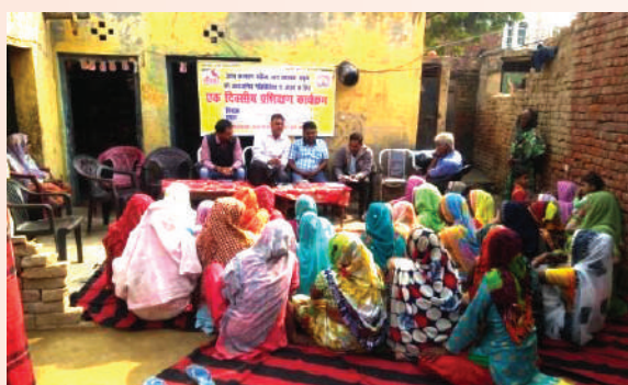
Training of Equine Groups on Income Generation Activities