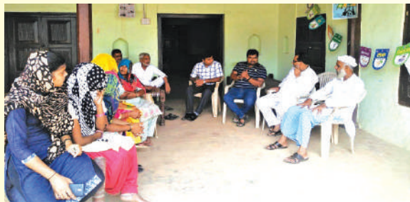
Village Health Sanitation and Nutrition Committee sensitization program

Village Health Sanitation and Nutrition Committee (VHSNC): This meeting is done