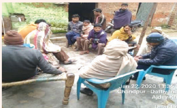
Community awareness on equine diseases and its treatment