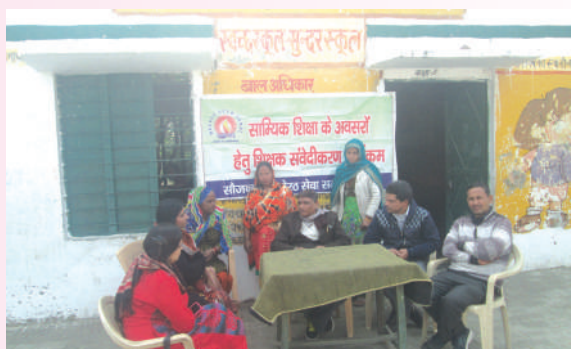
Teachers' sensitization on Girl's education health & hygiene