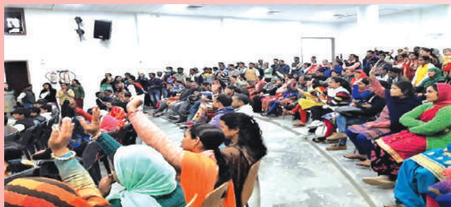
Community meeting for awareness on Routine Immunization

Under this program we provide medical helps in those areas there is lack of health centers. In this program we distribute medicine and other health related things by organizing health camps and outreach the community. Some children, who were unimmunized gets immunized by these health camps. Blood tests, Urine test & weight measures for pregnant women are also done for free in the health camps.