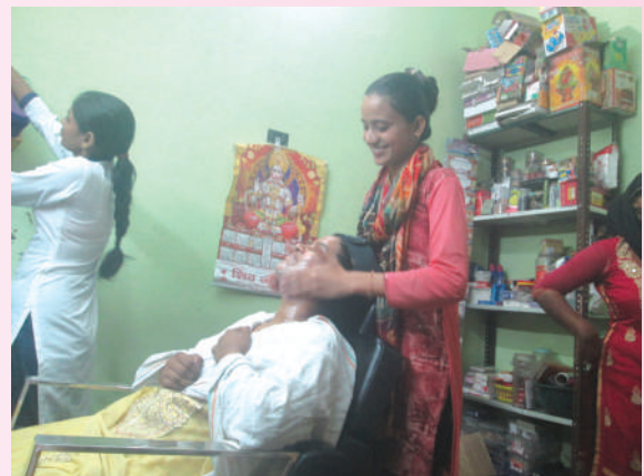
Beautician Skill Training to girls