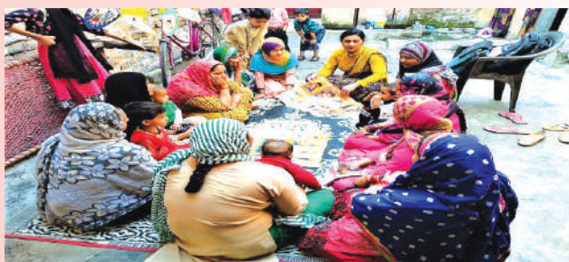
Mothers meeting and counseling

meeting: The main purpose of this activity is clear out all the myths spread in the community & to make aware the community about the real facts. In these meetings, people ask questions and gets clarify about the real information. In the year 2019–20, 891 mother /Adolescent Girls meetings were organized till the month of March 2020 involving 7089 mother / Adolescent Girls.