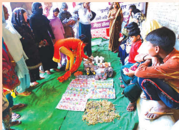
Displaying of IGP products by Group members