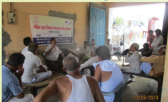
Training on Organic Farming & Pest Control