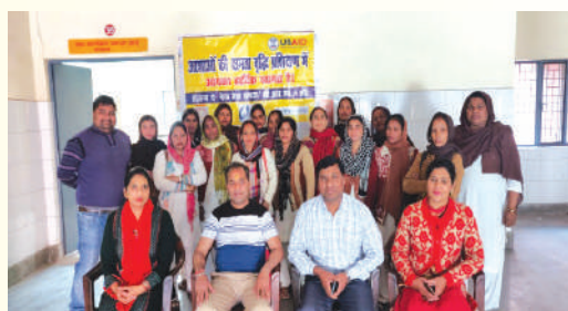
Capacity building of ASHA workers

Capacity Build of Asha: Training is done to strengthen Asha & AshaSanghni along with the CMCs, so that they may provide better services to the community by working in a good coordination with each other in preparing due list, Mother and child tracking etc., for more immunization of children. We have organized 4 Asha capacities build training in which 185ASHA took part.