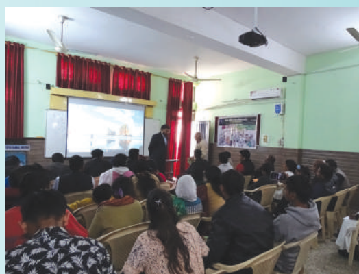
Social Teaching & responsibilities workshop