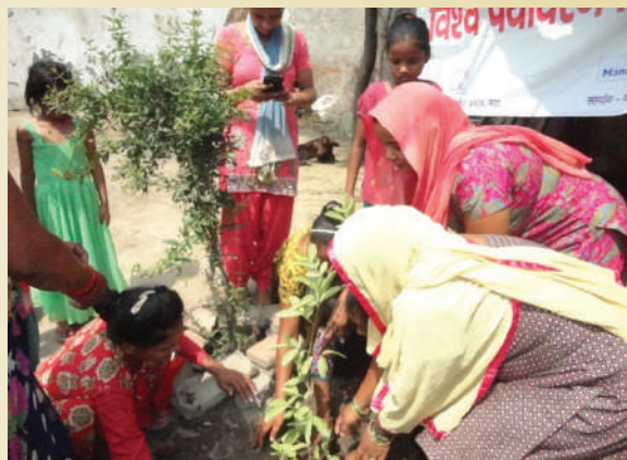
Tree plantation during Environment Day celebration

manure and fertilizers and using it in their field and kitchen gardens for cultivation of crops. 245 kitchen gardens have been established by the target groups and they are nurturing it and preparing nutritious diet by fresh vegetables taken from garden which will improve the health condition and reducing the purchase burden.