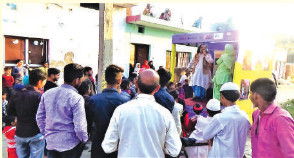
Nukkad Natak to sensitize community

Nukkar Natak: Under this activity we aware community for immunization with the help of Government health department. We organized street plays based on immunization and health services to guide and encourage the gathering for immunization of children. In year 2019-2020, we have organized 5 areas in four blocks.