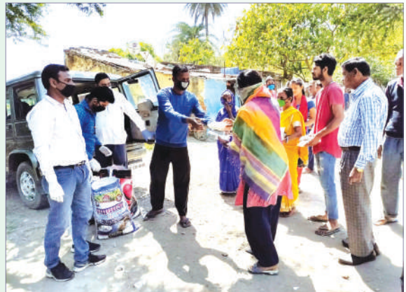
Dry Ration distribution by MSS team