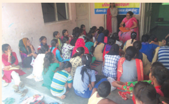
Training on Domestic Violence Act 2005