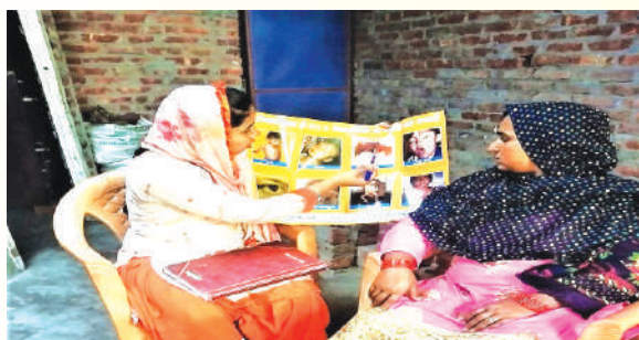
Inter Personnel Communication session