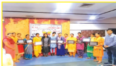
Memento distribution to CMCs

CMC Induction Training: Each year, follow-up trainings were organized for all the CMCs for updating the immunization methods/schedules. These trainings were imparted to the CMCs by the senior project staff after getting trained by CRS/CORE. This year also such trainings were given to all the CMCs. All the new 54 CMCs were given two days induction training in a city hotel to get them acquainted with the all the immunization methods. Momentous distributed to Sunehty CMC for their generous services.