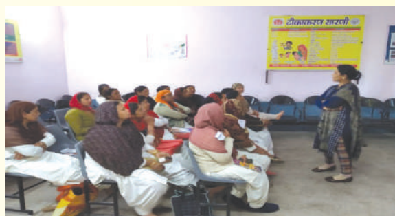
ASHA Coordination meeting

ASHA Coordination meeting: This activity is done to strengthen AAA i.e. ASHA, AWW & ANM along with the CMCs, so that they may provide better health services to the community by working in good coordination with each other such as making due list, Mother and child tracking etc., for immunization of children. In year 2019-20, we have organized 4 ASHA coordination meetings till the month of March 2020, in which 246 Asha have participated.