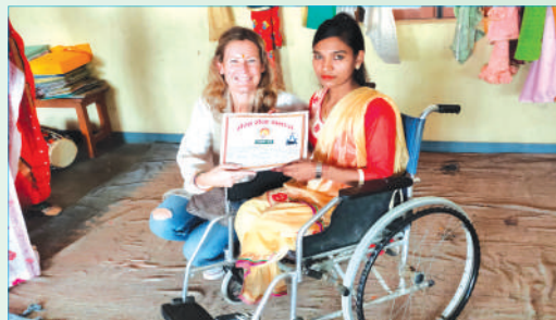
Certificate distribution to Tailoring trainee