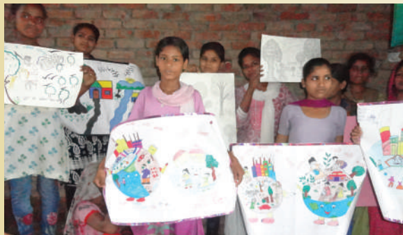
Sensitization through Poster Competition on Environment

Achievements made during the year are as under and benefits of welfare schemes channelized and facilitated during the year