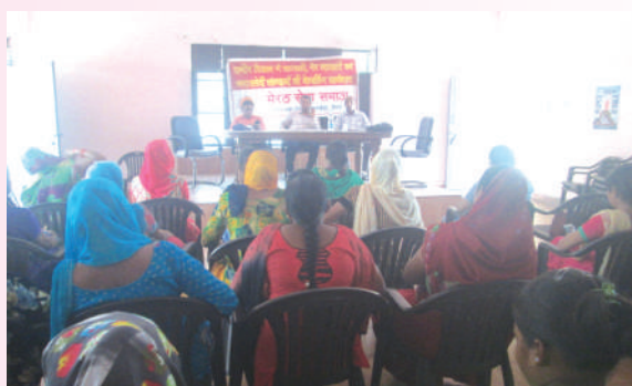
Networking meeting with ANM, ASHA & AWW for Health services to girls