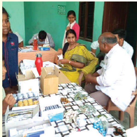
Health Camp at Ramnagar