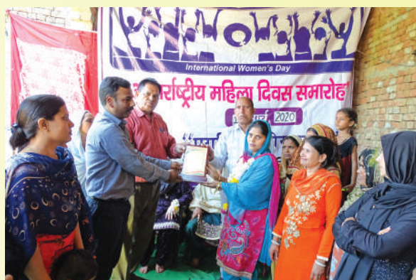
Felicitation on International Women's Day celebration

International Women's Day was celebrated in village Darkawada of Baghpat district on 17th March 2020 as more than 150 women and adolescent girls witnessed the day and were sensitized and mobilized for making their individual efforts in attaining their different rights as the theme of this year's celebration was Realizing Women Rights." Gram Pradhans and local leaders in their motivational speeches conveyed message to become more vocal and bold if they need to survive in this corrupted community. They must raise their voices collectively if any problem persists in the village for development