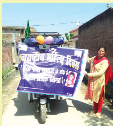
Celebration of International Women's Day at Rampur

Under Brooke India project, International Women's Day was celebrated at village levels by the efforts of Groups leaders and association members. Brooke project staff facilitated the program and inspired the women for their collective efforts and formation of groups and linking it with various equine related welfare departments for raising livelihood options.