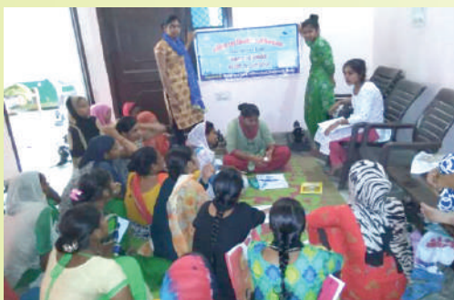
Sensitization on Health & Hygiene to adolescent girls at Vinaypur village