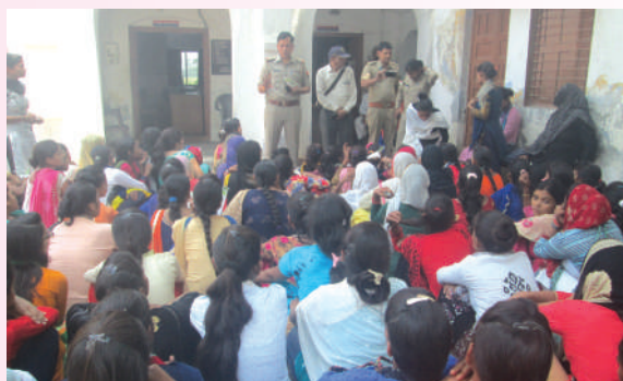
Exposure visit to Jani Police Station