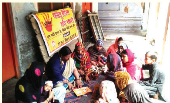
Awareness on domestic violence