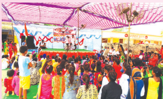
Celebration of Literacy Day cum Girl Child Day