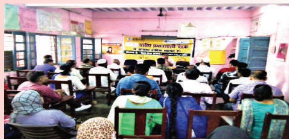
Influencers' sensitization meeting

Influencer's Meeting To make our program more effective and successful, influencers plays a great role to bring behavioural changes in the community. To avoid resistance in any area and to promote the awareness for polio, local influential people have been approached and they have addressed the resistance families for the importance of immunization of their children. In year 2019–20, 4 block level influencers meeting were organized, in which 203 influencers were added to our program to make awareness and help people get their wards immunized.