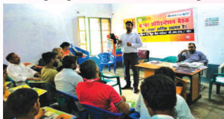
Barbers' Sensitization program on Routine Immunization

Barber's meeting: Communication and sharing the information with the help of Barber in the community when people visit barber shops for hair cutting and shaving. Hence this platform is used for passing the right information on immunization. In the year 2019–20, 2 barber's meetings are organized till the month of March 2020.