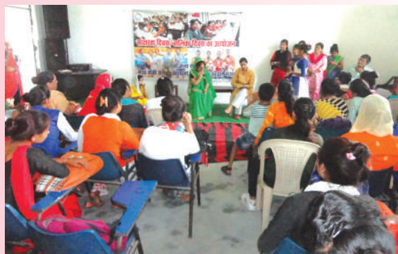
Celebration of Girl Child Day at Daurala

Recognizing the importance of a Girl Child, observation of Girl Child cum Literacy Day was held at Hastinapur and Daurala block on 7 th & 8 th September 2019. Near about 475 girls from the target areas witnessed the event resembling the empowerment process by framing the different role plays on social issues concerning adolescent perspectives. Cultural dance and songs and poetries were performed by the girls to sensitize the gathering to make efforts and utilizing the different opportunities of learning, education, skills development and trainings for the development.