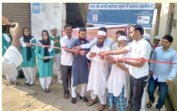
International Peace Day Celebration