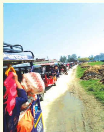
E-Rickshaw rally during Women's Day celebration

Similarly in village Lalyana, International Women's Day was celebrated on 8th March