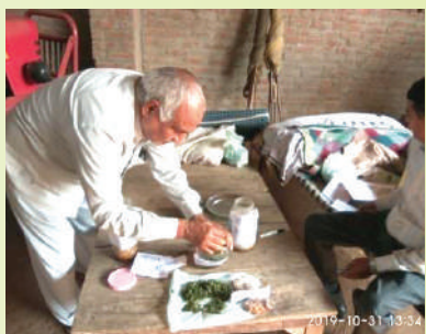
Soil Enzymes preparation