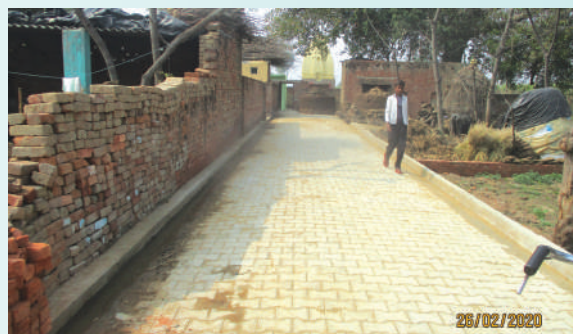
Constructed brick pavement as Gram Sabha members strengthened