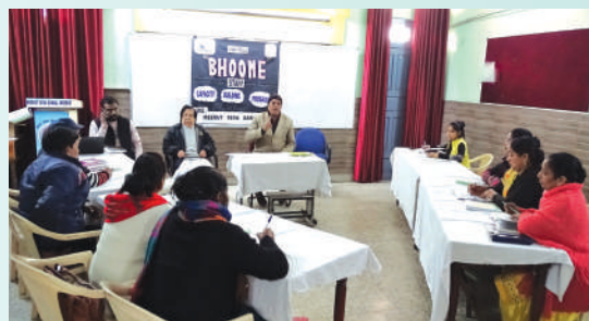
Orientation cum Capacity building of staff