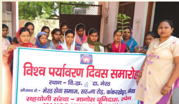
Observing World Environment Day