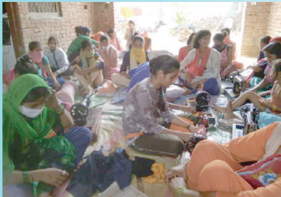
Skill training on Tailoring and Stitching at Mansurpur village

We have imparted six trainings on tailoring and stitching six months course for the target