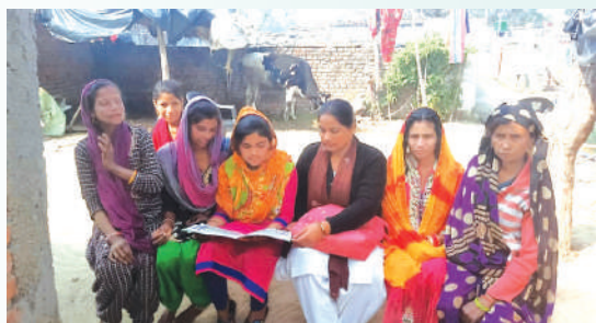
Baseline survey of the target area

This project was started from Jan 2020 and it is designed in accordance to the ground reality of the damage caused to the agricultural land due to use of chemical fertilizers and pesticides. Adapting the sustainable organic agricultural techniques and methods to revive the land fertility and its natural minerals ultimately increase in crop production generating some livelihood options by developing skills and environment friendly practices.