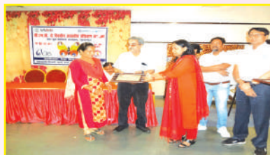
Felicitatation of CMC for Generous work