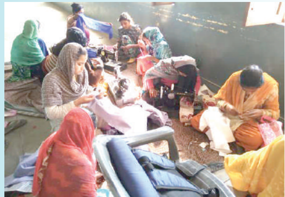
Tailoring Skill Training at Loni village

groups and 117 beneficiaries got skilled in this trade. They have learnt to stitch clothes and prepare female dresses and working from their home and earning some income by learning the trade and thus they are becoming economically empowered and self dependable. Likewise