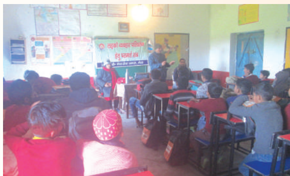
Behaviour modification sessions for boys