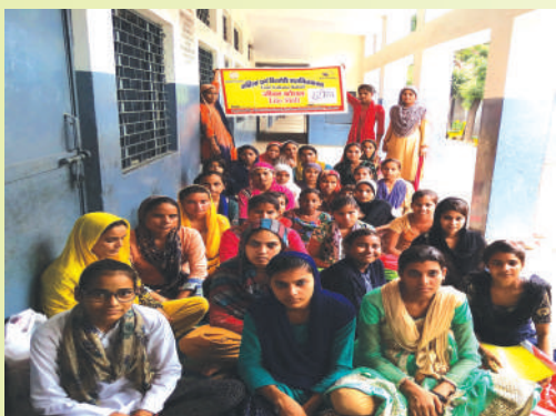
Life Skill training session for adolescent girls at Rataul