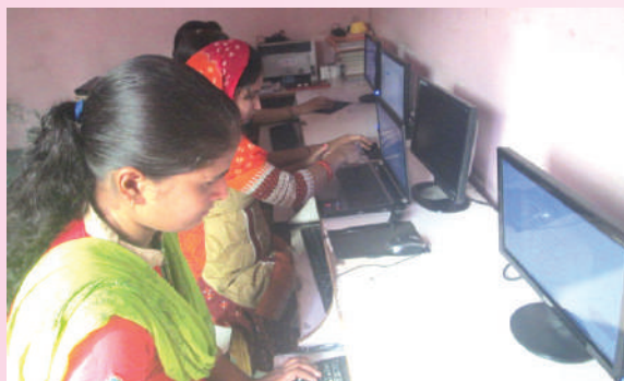
Educating Computer Proficiency to adolescent girls