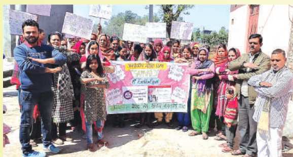
Celebration of International Women Day