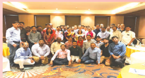
Core Group Polio Project review meeting

CGPP PROGRAM SUPPORTED BY CATHOLIC RELIEF SERVICES is working in Saharanpur district in 4 blocks namely City, Sunehy, Sarsawa and Nakur. The project's main objective is to motivate polio eradication and immunization. Under the City Saharanpur 13 villages and 24 urban wards HRA (High Risk Area) is being covered. We have the workforce of 54 CMCs (Community Mobilization Coordinator), 4 BMCs (Block Mobilization Coordinator), 1 MIS (Management Information System) and 1 DMC (District Mobilization Coordinator) employed till September 2019. From October-2020 in Sunhety block all CMC's removed as Sunhety block is set as a block model and now working with only 43 CMC's.