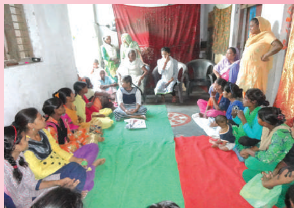
Training on Puberty changes and legal rights at Fazalpur

Adolescent girls mainly suffer a lot during puberty period due to bodily changes occurs in the body and don't able to tackle the mental and physical stress and anxiety. They feel shy and fear to express their problems in the family. Hence, 167 adolescent girls were approached and educated on the menstrual health system which has cleared their doubts and myths lessening psychological effect. They are more cautious and using sanitary pads availing from local health resources.