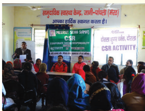
Health Camp at Jani under CSR activity

Persons in their keynote address they emphasized on the different services given by the health centers and villager health workers. They also aware the girls on the physical attributes of the female and the menstruation