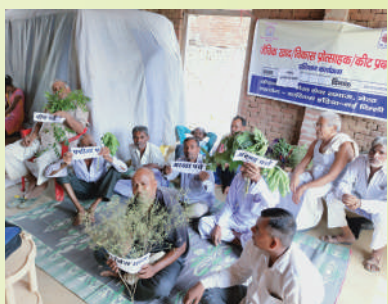
Training on preparation of Herbal Pesticides