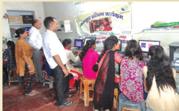
Promotion of Computer Literacy for Adolescent Girls at Binauli, Baghpat

Enriching the knowledge of women and adolescent girls to promote organic farming and contributing in conservation of soil and environment, six World Environment Days were observed and during these platforms we have planted 3610 saplings during tree plantation drive in the target area. We have installed eight vermin compost bed and preparing organic