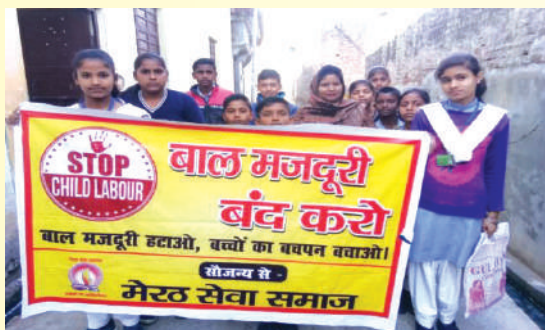
Awareness rally on Child labour

In the mothers meetings activities, the labour law and rights were also aware them on child labour, domestic violence which is a crime.