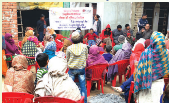
Orientation to villagers on PRI Roles and Responsibilities