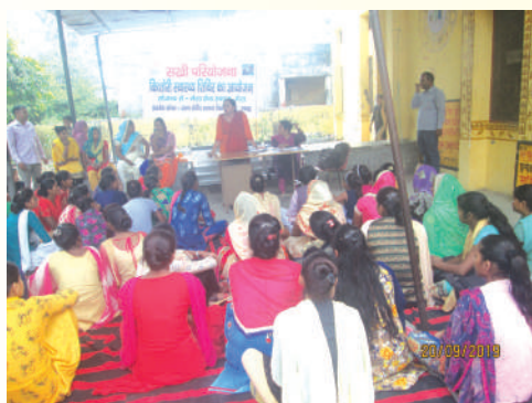
Health Camp for adolescent girls at Jani Khurd

World Health Day was celebrated on 26th April 2019 at CHC Panchli and 73 adolescent girls have witnessed the event. During the program, Medical Officer In-Charge (MOIC) in his speech addressed the girls on the health issues and problems pertaining in adolescent girls. He also enlighten the girls on the various seasonal diseases occurring mainly during the rainy season and the common measures of precaution to be taken care of from getting sick and proper immunization should be done timely. On the same day of celebration of World Health Day, a health camp was also organized for the participants. 24 girls have done Hemoglobin and Blood group test, 16 girls have done eye test, three girls have done diabetes test and eleven girls have done routine health check-up for common sickness.