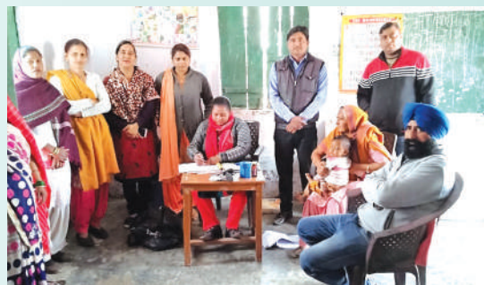
Networking meeting with the stakeholders