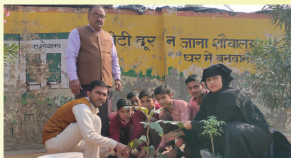
Tree plantation drive for Environment protection