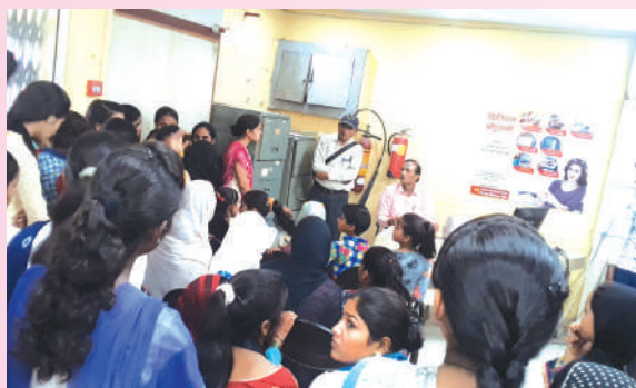
Adolescent Girls Exposure visit to PNB, Jani