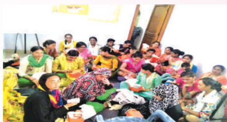
CMC Sakhi Training program

Barber's meeting: Communication and sharing the information with the help of Barber in the community when people visit barber shops for hair cutting and shaving. Hence this platform is used for passing the right information on immunization. In the year 2019–20, 2 barber's meetings are organized till the month of March 2020.