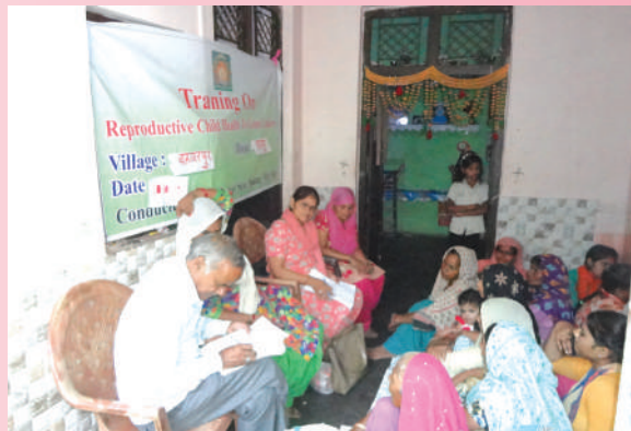
Reproductive Child Health training at Bahadarpur village, Sarurpur

We have imparted training to 158 women leaders and adolescent girls leaders and capacitated them on Reproductive Child Health care to reduce the infant and mother mortality rate. Lack of awareness and hesitation on this issue, they don't speak openly results in different malpractices which contributes in high mortality rate. The beneficiaries have gained knowledge and they are opting for institutional delivery and safety measures during pre & post pregnancy by accessing health institutions and centers.