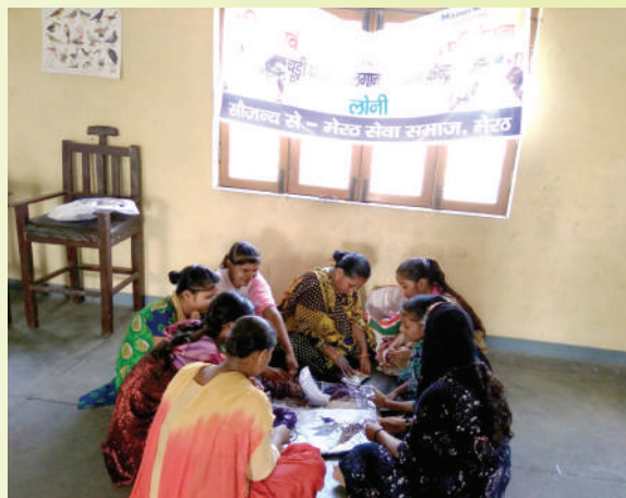
Bangle designing training at Loni

We have sensitized and aware the community on the importance of health and to upgrade the health status by tapping health services delivered by village level frontline health workers. 242 women and girls have understanding on the various aspects of individual's health by ensuring proper diet, safe drinking water, hand washing practices, proper sanitation and hygiene during puberty changes and various welfare health related schemes and process to tap these. To counter the dreadful diseases and boost immunity, promotion of vaccination and participation in routine immunization drive was emphasized. 317 beneficiaries have developed deep understanding on the importance of vaccination and availing the services. 276 people were reached and awareness created on different government welfare schemes. 183 adolescent girls have sensitized on the menstrual system and special attention is given by girls on sanitation by promotion of sanitary pads. To bring social and behavioural changes in girls to resemble moral and principles of life, life skill orientation programs were held and 179 girls mobilized for having prosperous life by proper time and stress management, work load, communication skills and soft spoken skills, learning attitude to tackle the harsh circumstances of life. Few achievements as per our goal are as under: