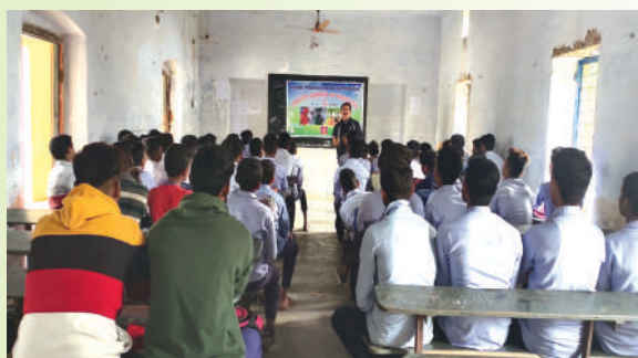
Orientation of Peace Club