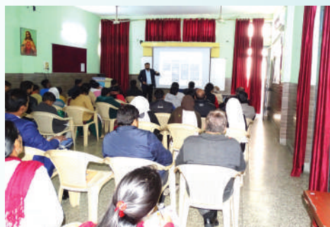
Key Strategic Pillar workshop

A workshop on Catholic Social Teaching and Key Strategic Pillars (KSP) was organized on 16 th February, 2020 for the parishners and members of Faith Based Organizations (FBO) from Meerut diocese. The workshop was attended by 48 participants of which 36 were laities and 12 were from FBO's from Kankerkhara, Modinagar & Cathedral parishes.