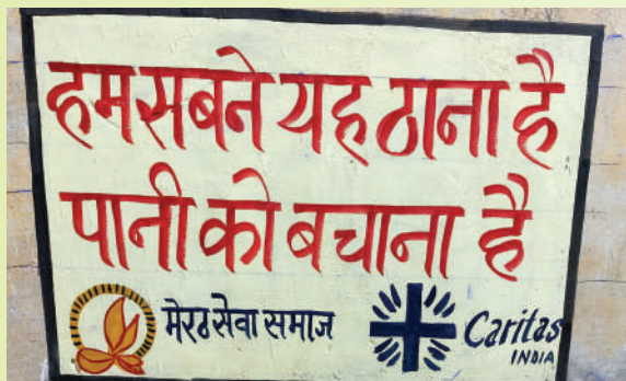
Awareness creation through Wall painting in Bhuni village