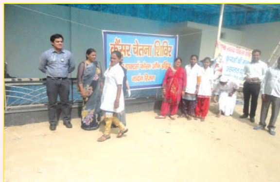
Cancer awareness camp at Surani