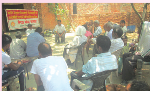
Networking meeting with PRI Committee on Girl Rights & entitlements