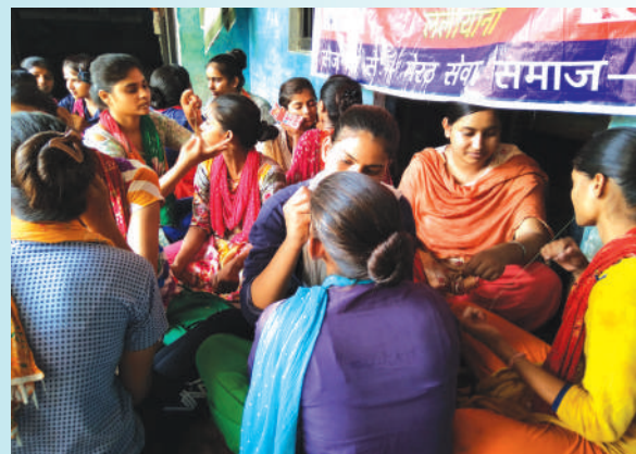
Skill training in Beautician at Lalyana village