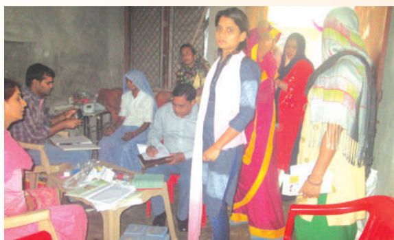
Health Check-ups for Adolescent girls