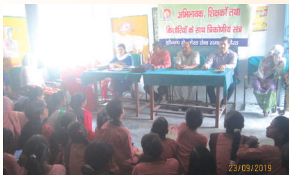
Triangular meeting of Teachers, parents and Girls