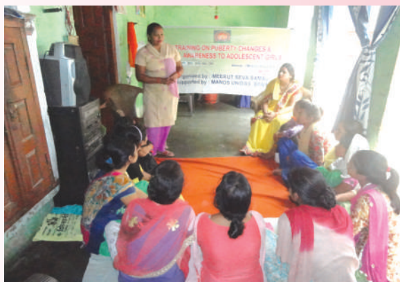
Training on Puberty changes and legal rights at Mohammadpur Dhumi

We have imparted training to 158 women leaders and adolescent girls leaders and capacitated them on Reproductive Child Health care to reduce the infant and mother mortality rate. Lack of awareness and hesitation on this issue, they don't speak openly results in different malpractices which contributes in high mortality rate. The beneficiaries have gained knowledge and they are opting for institutional delivery and safety measures during pre & post pregnancy by accessing health institutions and centers.