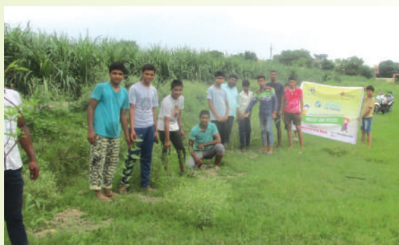
Tree plantation during Earth Day Network campaign