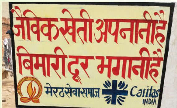
Communication through Wall writing in Dahar village