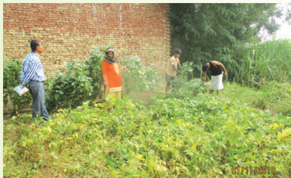
Kitchen Garden installed in Kakkepur village