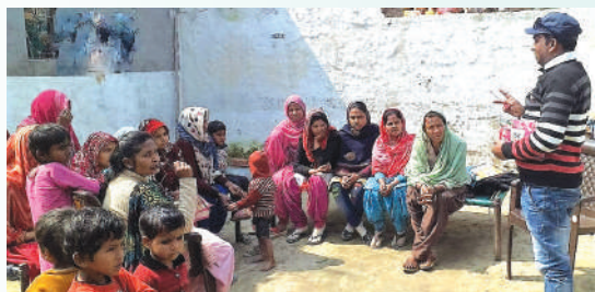
Meeting with women for farmer group formation