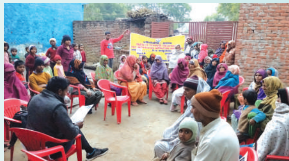
Awareness on Govt. Welfare Schemes at Dahar village