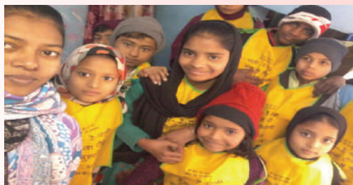
Bullawa Tolly for participation in Routine Immunization

Bulawa Toli: It is made for the reason that more and more children must get immunized on Routine Immunization day. Bulawa Toli is made by gathering children between the ages of 8–10 years. These Bulawa Toli children call other children from their houses so that maximum number of children can be covered. In year 2019–20, 204 Bulawa Tolies has been conducted in which 2040 children had taken part and raise the awareness for immunization.