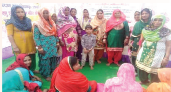
International Women's Day celebration by Equine group members