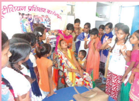
Beautician Training to adolescent girls at Kaland and Mohammadpur Dhumi

Recognizing the importance of a Girl Child, observation of Girl Child cum Literacy Day was held at Hastinapur and Daurala block on 7 th & 8 th September 2019. Near about 475 girls from the target areas witnessed the event resembling the empowerment process by framing the different role plays on social issues concerning adolescent perspectives. Cultural dance and songs and poetries were performed by the girls to sensitize the gathering to make efforts and utilizing the different opportunities of learning, education, skills development and trainings for the development.