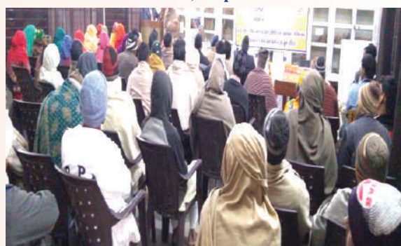
Training of Equine Groups on Income Generation Activities