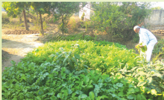
Promotion of Kitchen garden in Ekdi village