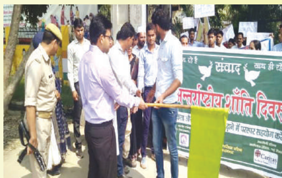
Celebration of International Peace Day