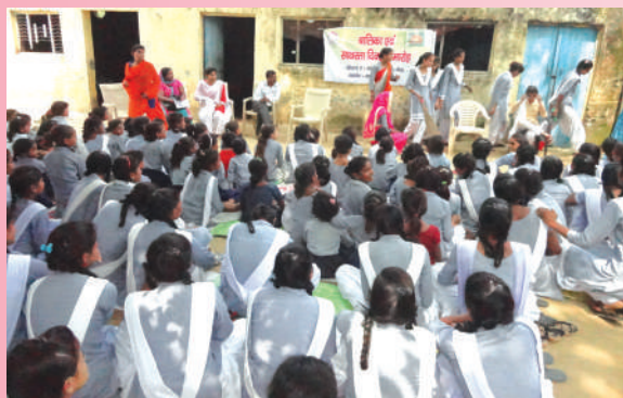
Girl Child Day celebration at Hastinapur