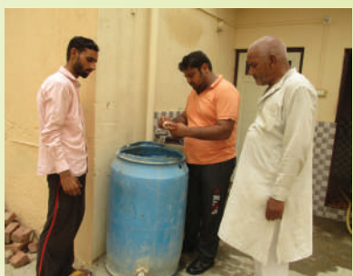
Preparation of Waste Decomposer for organic manure