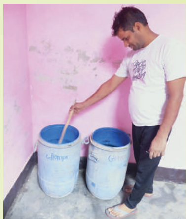
Jeevamrit–Growth promoters and organic pest repellent prepared by the farmers