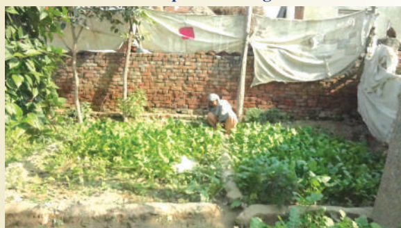
Kitchen Garden established by group member at Darkawda