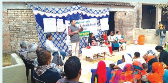
Training on organic farming practices