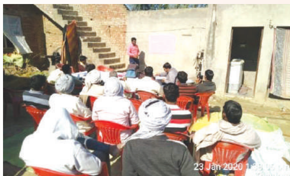
Training on Mushroom cultivation for equine owners