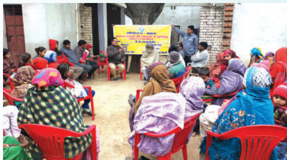
Sensitization of PRI members on their roles & responsibilities