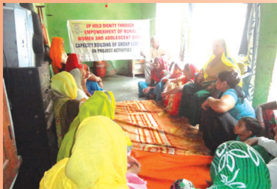
SHG Group Leader Capacity building at Mohammadpur Dhum

the target groups for becoming more vocal and self dependable by grabbing the opportunities made available at local level to upgrade their living conditions. The main objective of the project is to improve the living and social conditions of marginalized women and adolescents girls of the target area. For attaining the results, we have emphasized on four components of development i.e. capacity building programs on various subjects to enhance knowledge and communication, sensitize them on their health and hygiene and ways to upgrade their health by availing services from government health system, to induce social ethics and principles of life through life skills sessions to boost personality of adolescent girls and developing skills on various trades to earn some livelihood and making their future more secure, promoting different sustainable organic farming practices for increasing crop production with very economical load on input cost.