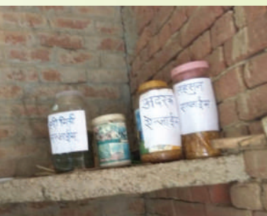
Promotion of Herbal Soil Enzymes