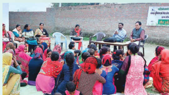
Training on organic growth promoters