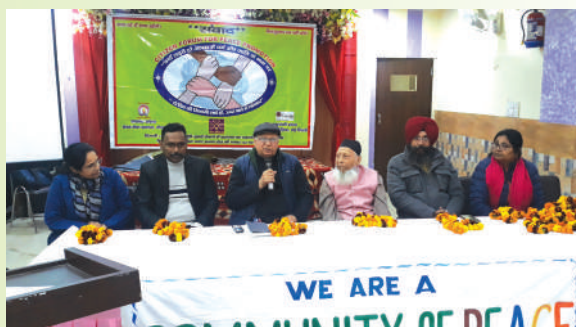
Citizen Forum meeting at Muzaffarnagar for Religious harmony