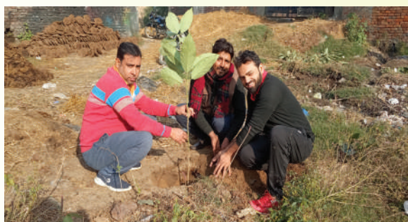
Planting of tree on Environment Day