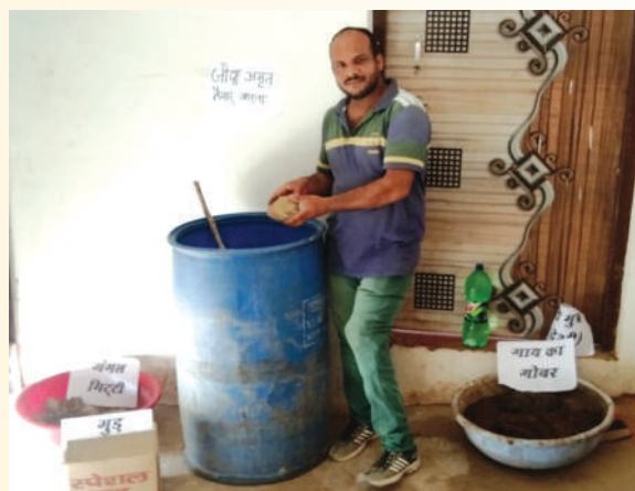
Preparation of Jeevamrit-Organic Growth Promoter