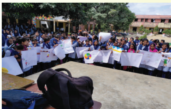
Poster Competition during World Environment Day Celebration