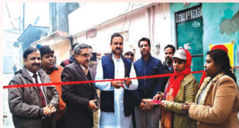
Polio round Inaugural session

Polio Eradication Program: We have come to know that our initiative has contributed in making our country polio free and it was announced by W.H.O. W.H.O. (World Health Organization) on 27 March, 2014. In year 2019-20, under this program a total of 4 rounds of polio were organized, in which a total of 65252 children were immunized in the district out of which 65950 children were immunized by our organization