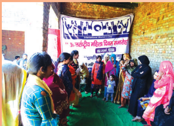
International Women's Day Celebration at Darkawda

During this year, we have formed new 49 women Self Help Groups (SHG) reaching 582 women and strengthening them with various capacity building programs and trainings. They have attained knowledge on Self Help Group and its functioning by participating in different meetings and programs. 165 members have enriched with the leadership, SHG management, monthly savings, financial transaction and its utilization through inter-lending process and income generation process.