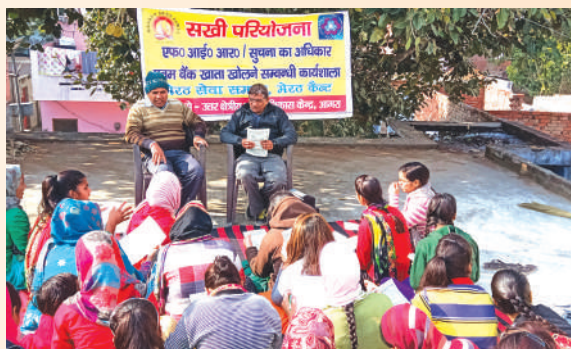
Training on Legal literacy