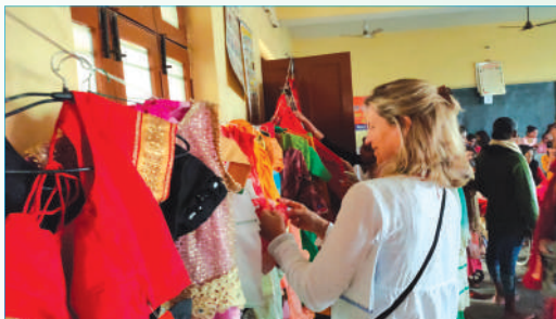
Dress exhibition at Loni Tailoring center