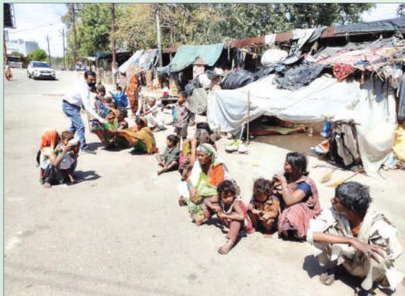
Distribution of ration to pandemic victims

During this tough time of global pandemic, Meerut Seva Samaj deliberately engaged in the relief to the devastated migrants and labourers by providing them dry ration kits. We have able to aid 530 people in our project area which has brought some comfort in this harsh time.