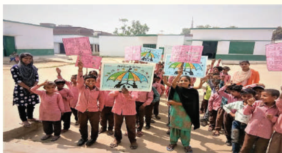
Kuk-du-ku Rally awareness program

Kuk-du-ku Rally: This rally is conducted to promote the habit of doing toilet in the permanent toilets instead of open defecation. In this activity we spread awareness of using permanent toilets by assembling kuk-du-ku rally which is made by school children. In year 2019-20, total 54 kuk-du-ku rallies have been organized till the month of March 2020 in which 1080 children participated.