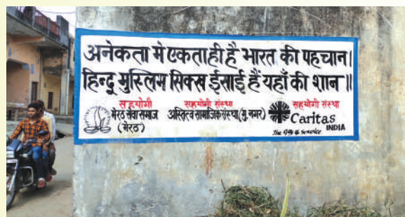
Awareness Creation by Wall Painting