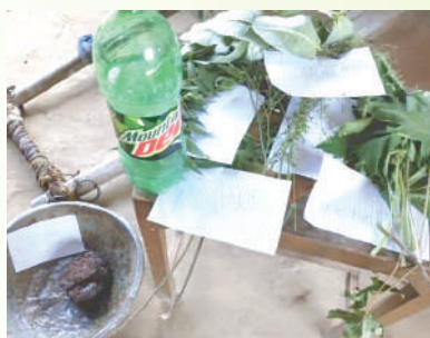
Training on preparation of Herbal Pesticides