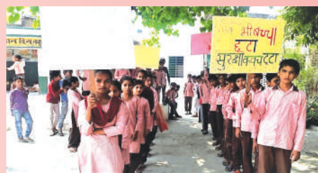
Children rally (Polio Rally) for Polio Vaccination

Polio Class/ Children Rally: Under this activity, children from local schools take part to organize a group which is known as Polio class. Through play we teach them how to keep cleanliness and how to prevent from polio disease. 364 Children Rallies/Polio classes organized in the year 2019 – 20 in which 7280 children took part.