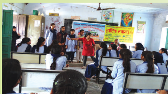
Sensitizing of Peace Club