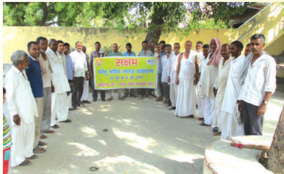
Awareness on Labour Rights and Laws

In Meerut and Baghpat district, 42 training programs were conducted and sensitized the target people on the provisioned entitlements, labour laws, registration in labour department and its benefits. 872 people were capacitated on the above subject and made efforts to enroll their names in the labour department. As a result, 225 people enrolled their names and 125 people got benefitted under different labour welfare schemes.