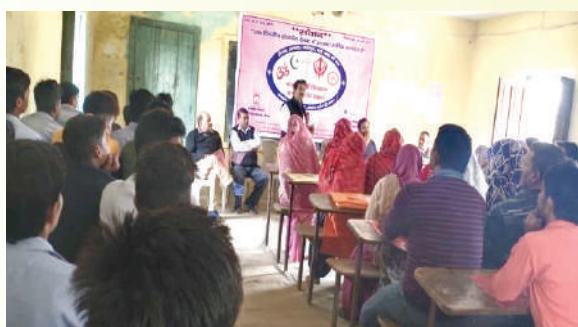
Interface meeting with Stakeholders