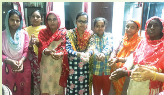
Educating Safe hand wash practices