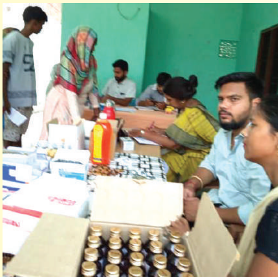
Medicine distribution at Ramnagar Health Camp

In Saharanpur district, people of Ramnagar were suffering from Diarrhea, Skin allergy and fever so we, with the close coordination of health department, organized a health camp in Ramnagar on 22 Jun 2019, in which 212 patients were checked and given free medicine to all of them.