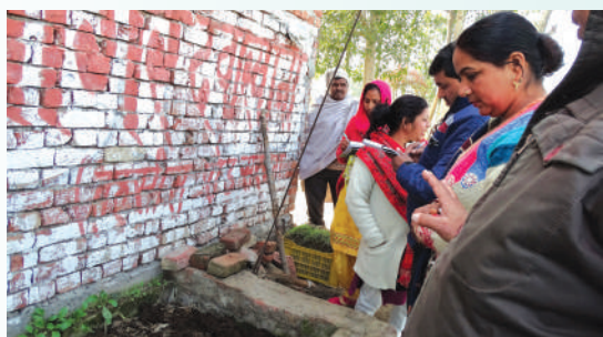
Onsite Exposure visit on organic farming