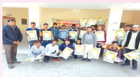
Informative materials distributed to Barbers'

CMC Sakhi Meeting: In this meeting CMC Sakhi takes part along with CMC, BMC & DMC. In this meeting we discussed all key discussion regarding child immunization, sanitation, health & help to CMC for aware the community. In year 2019–20, total 4 CMC Sakhi meetings have been done till the month of March 2020.