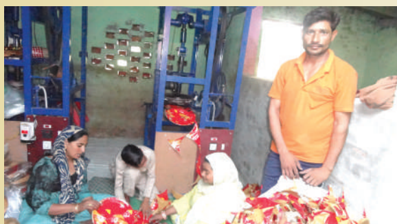
Group members involved in disposable plate IGP activities