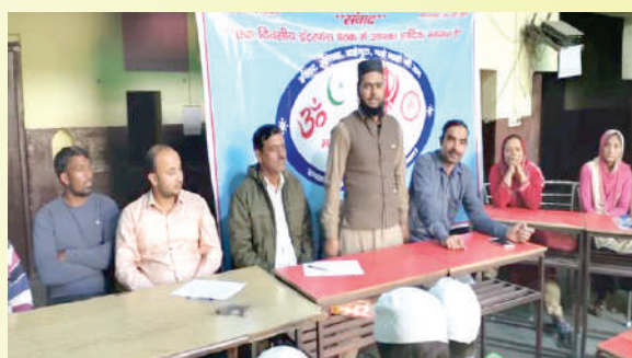
Interface meeting with Key Stakeholders