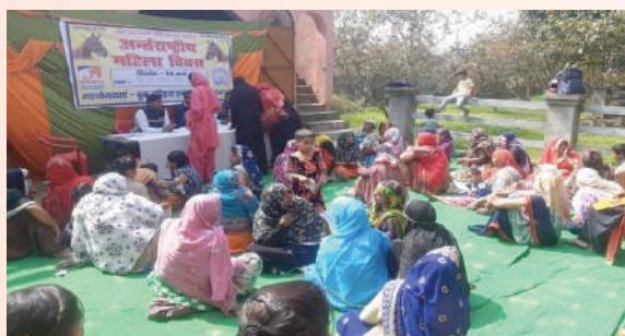
Celebration of International Women's Day