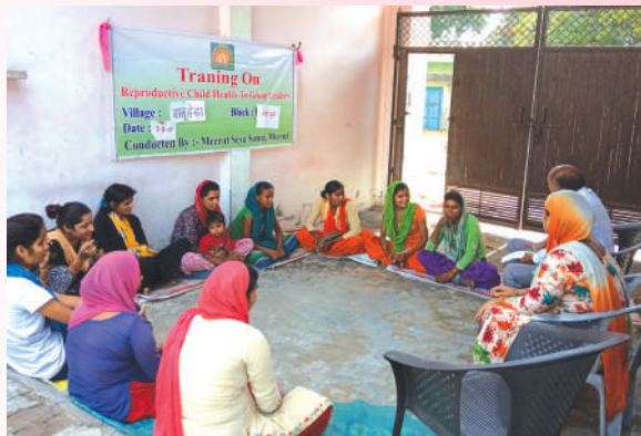
Training on Reproductive Child Health at Daluheda

Women's Day celebration was held on 17 th March 2020 in Darkawda village of Baghpur district and more than 150 women and girls from nearby villages registered their participants. Village local leaders motivated the gathering to pursue the knowledge and enhance their capacities on growth oriented activities which will certainly bring social and economical transformation in their lives to attain their rights.