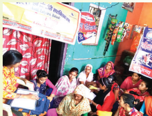
Training on Life Skill for adolescent girls at Lalyana village