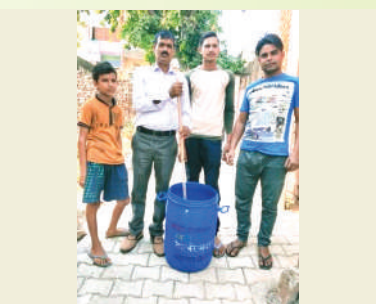
Preparation of Herbal Pesticides by farmer