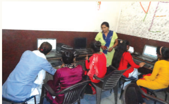
Computer Education to Adolescent Girls at Daurala

Sustaining the livelihood options and income with skill development technique, different skill trainings on tailoring and stitching, beautician and Basic Computer course were organized by MSS at local resources. 117 girls & women have learnt the technique of tailoring and stitching and engaged in stitching dresses and thus generating some income to sustain their future. 117 girls have received the training on beautician and become skillful and they are working in beauty parlors and earning livelihood. 40 girls have trained on Basic knowledge of Computer and its operations making them efficient and self dependable and more confident and vocal to communicate in the society which proves their liberty.