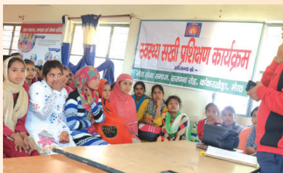
Health Sakhi Training program to upgrade health status