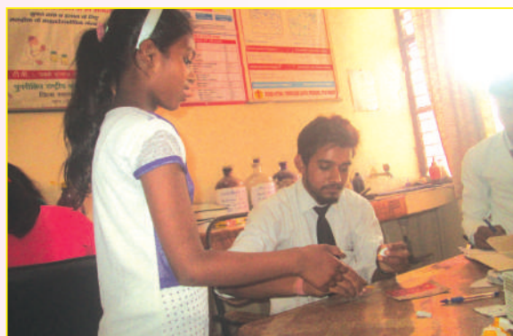
Hemoglobin test of adolescent girls at Panchli