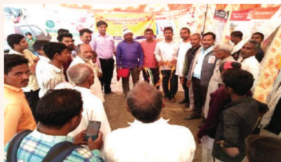
Equine owners counseling during Equine Trade Fair, Hapur