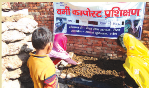
Vermi Compost training at Saraswa