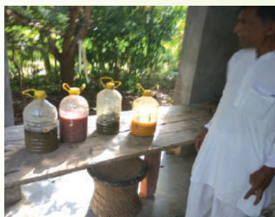
Soil Enzymes Growth Promoters prepared by flowers and fruits