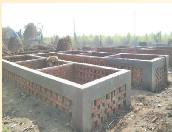
Organic waste decompose pit at Dahar village

Synonymously, mobilizing villagers about various government welfare schemes and entitlements, they have developed deep understanding on the schemes and become more vocal and increased their confidence to speak out in front of concerned authorities and government functionaries. They have enhanced their intellectual gain and known the means and resources and approaching and making efforts for tapping the benefits of the schemes to attain their rights and entitlements provisioned for them. Villagers are aware of their entitlements and they are approaching the concerned departments for enrolling their names in different welfare schemes to avail the benefits.