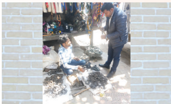
Mentoring & Supervision of Equine Farrier for equine welfare