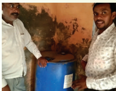
Waste Decomposer preparation