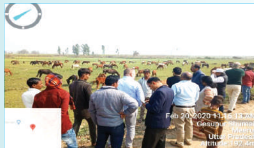
Brooke India UK Trustee visit to Qalandar site