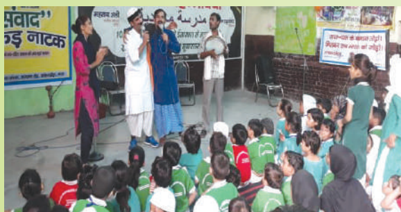
Sensitization on Peace & Harmony through NukkarNatak