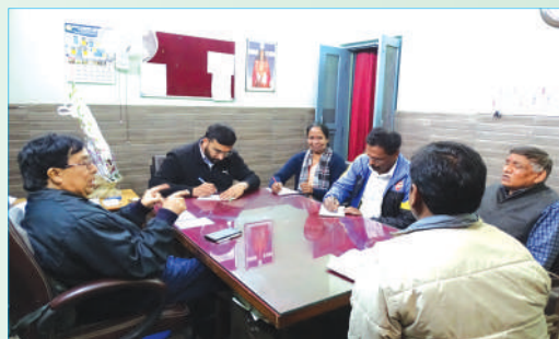
Feedback session of monitoring visit UKSVK, Agra