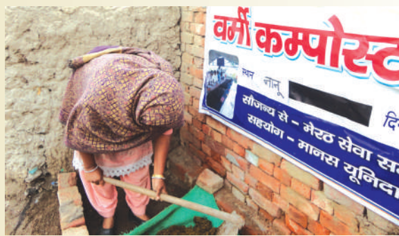
Vermi Compost training at Nanu