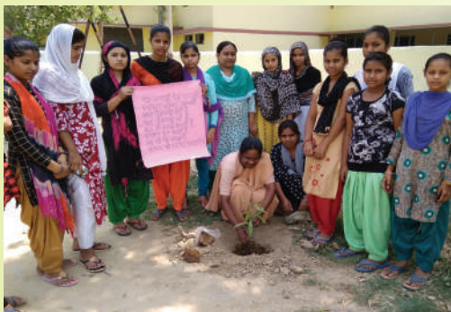
Tree plantation at Rataul during Environment Day celebration