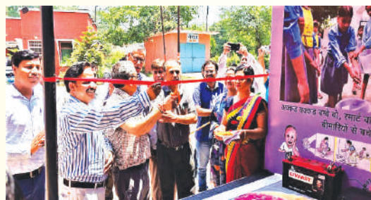
Inauguration of Khushi Express Van

Khushi Express Van: Main purpose of this activity is to communicate the right information with this van in the target community and clear all the myths prevailing for the immunization of children. A person passes information among the community with the help of a loudspeaker and various informative materials designed inside the van. In year 2019–20, we have covered 66 areas in four blocks till March 2020.