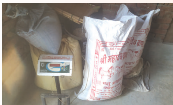
Establishment of Mix feed Unit by Equine socation