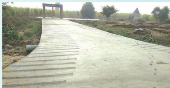
Kakkepur Cemetery Road constructed after Gram Sabha meeting result