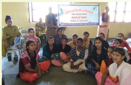
Awareness on Health & Sanitation at Loni village