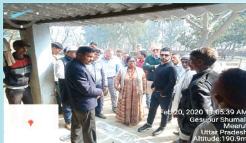
UK Brooke India Trustee interaction with Qalandar community