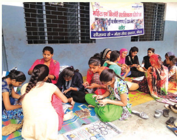
Training on Bangle designing at Rataul

To generate income and employment in small scale, we have conducted twelve skill trainings on bangle designing. 120 trainees have developed the skills to do various designing on plain bangles. They have got market exposure for raw materials and finished goods so that they can establish small units in their villages and can do startup. By developing their skills and knowledge and exposure to the different markets, they are gradually in the path of empowerment and development.