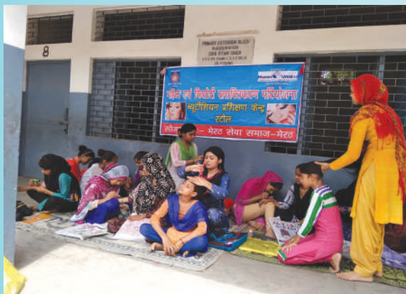
Skill development on beautician trade at Rataul

groups and 117 beneficiaries got skilled in this trade. They have learnt to stitch clothes and prepare female dresses and working from their home and earning some income by learning the trade and thus they are becoming economically empowered and self dependable. Likewise