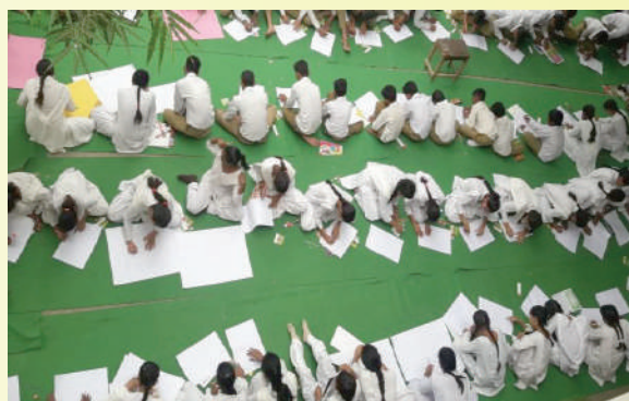
World Environment Day Celebration through Poster making