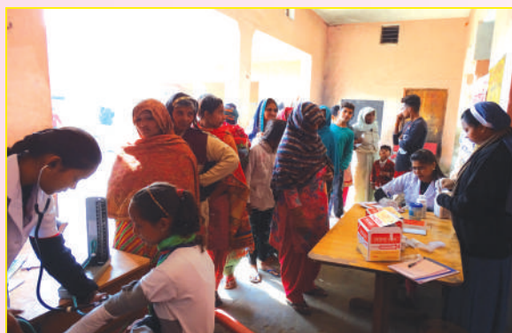
Health Camp at Baparsi under CSR activity