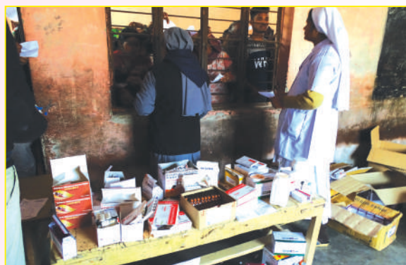
Free medicine distribution at Baparsi Health Camp