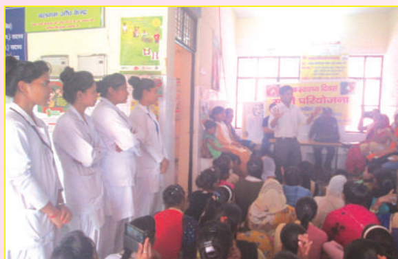
World Health Day celebration at Panchli