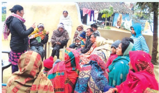
Rapport building with the villagers