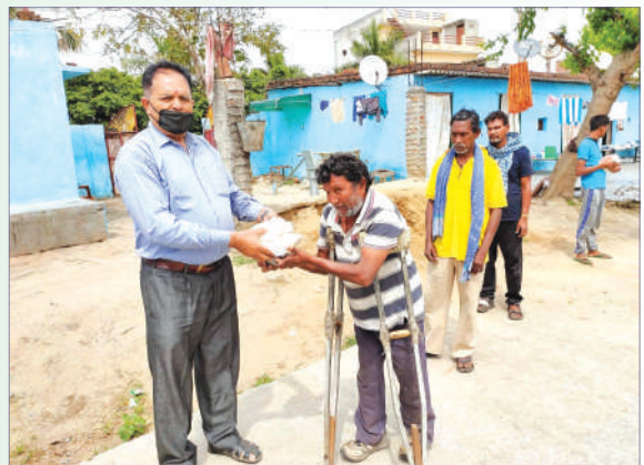
Distribution of dry ration to the deserving poor