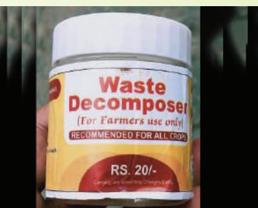
Waste Decomposer solution