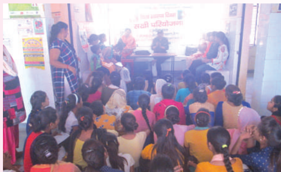
Observation of World Health Day