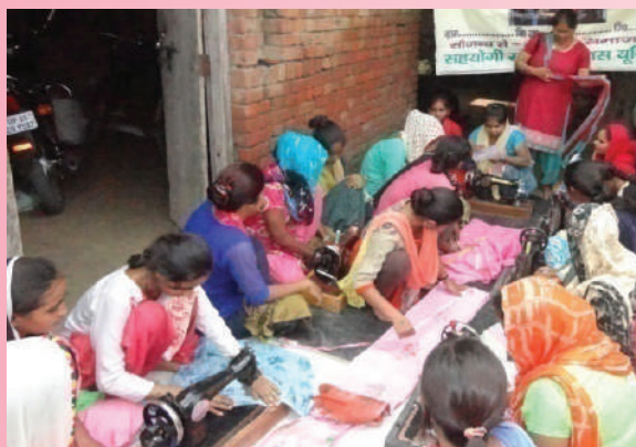
Skill Training on Tailoring at Dedwa and Daluheda centres