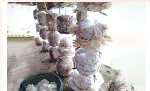
Mushroom Production Unit installed by Equine Group