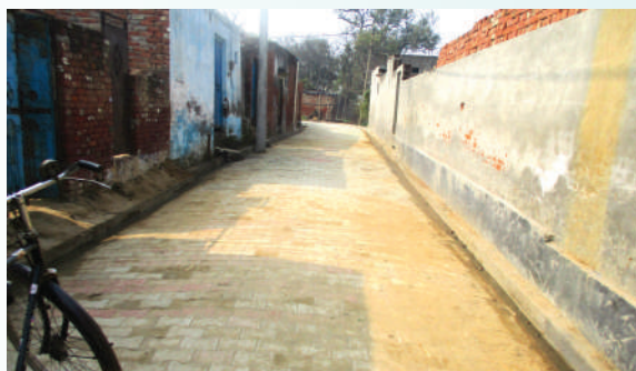
Brick pavement constructed in Meharmati village