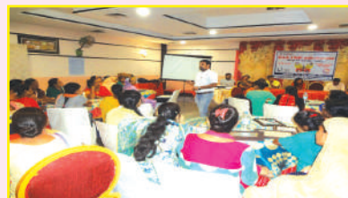
CMCs Induction Training