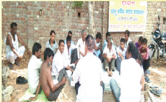
Awareness program on Labour laws and entitlements