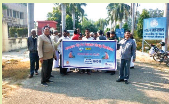
Exposure visit to Mushroom Research Center, Modipuram