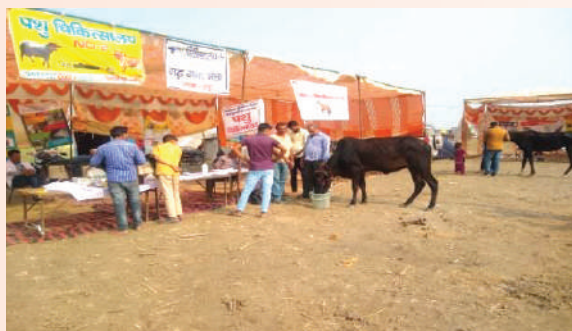
Facilitation in Equine Trade Fair, Hapur