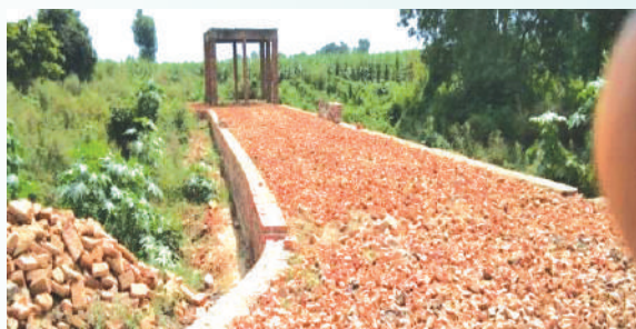
Kakkepur Cemetery Road construction process