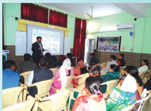
Workshop on Catholic Social Teachings