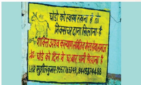
Awareness generation by Wall writings