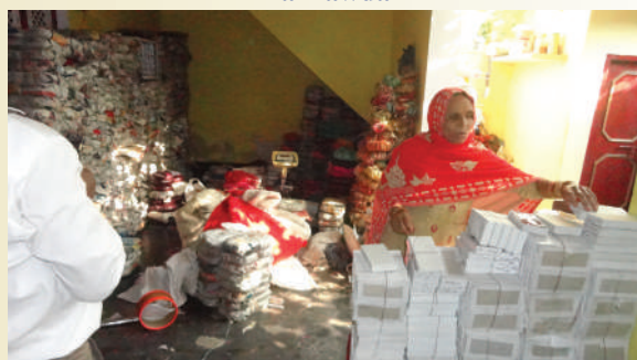
Bangle making by SHG group members