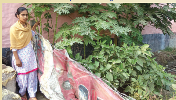
Promotion of Kitchen Garden at Timakiya