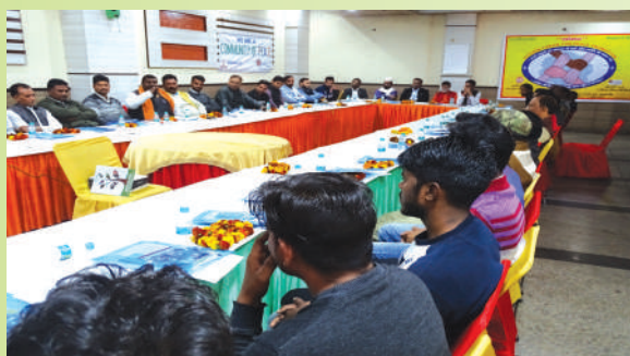
Citizen Forum meeting at Saharanpur for Social Integrity