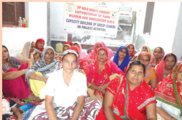
Capacity Building of Group Leaders at Johri, Baghat

During this year, we have formed new 49 women Self Help Groups (SHG) reaching 582 women and strengthening them with various capacity building programs and trainings. They have attained knowledge on Self Help Group and its functioning by participating in different meetings and programs. 165 members have enriched with the leadership, SHG management, monthly savings, financial transaction and its utilization through inter-lending process and income generation process.