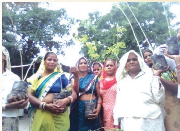
Sapling distribution during Environment Day celebration

Enriching the knowledge of women and adolescent girls to promote organic farming and contributing in conservation of soil and environment, six World Environment Days were observed and during these platforms we have planted 3610 saplings during tree plantation drive in the target area. We have installed eight vermin compost bed and preparing organic