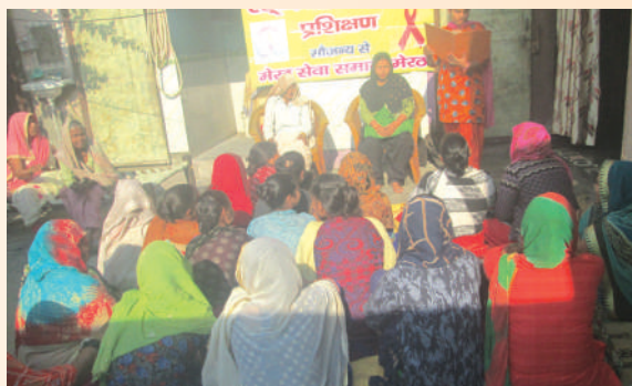
Awareness generation of HIV-AIDS