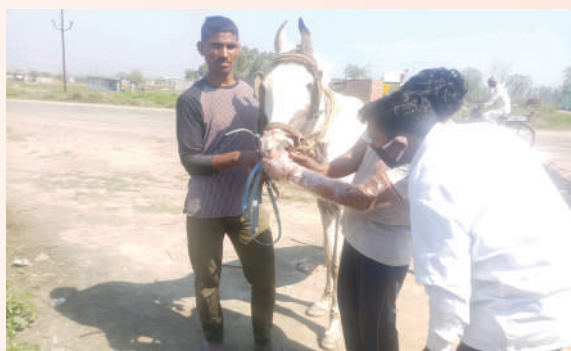
Mentoring of Animal health provider for timely treatment