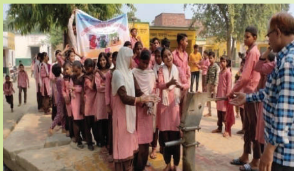
Promotion of WASH safe practices