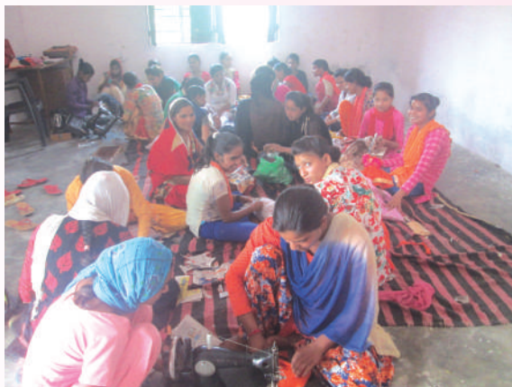
Skill training on tailoring to adolescent girls

40 girls have received basic computer course and become acquainted with the computer operations which is mandate requirement in today's era. Few girls have become instructors in computer institutions and some are getting advance course in computer applications and preparing for competitions for government jobs.