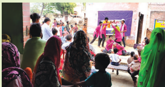
Promotion of Peace through NukkarNatak