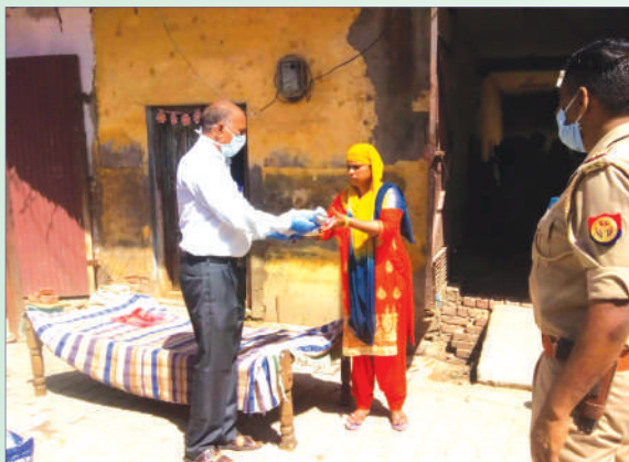
Support of Police administration during ration distribution