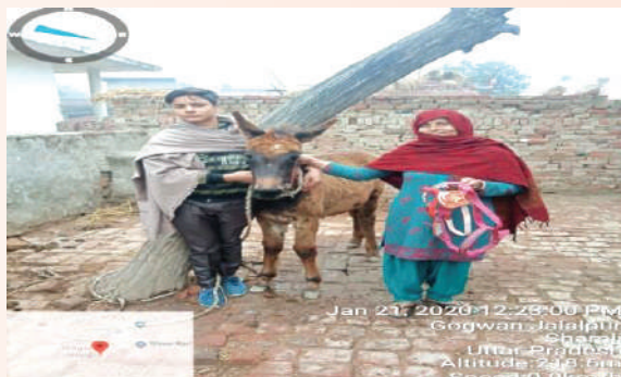
Healthy Equine competition winner