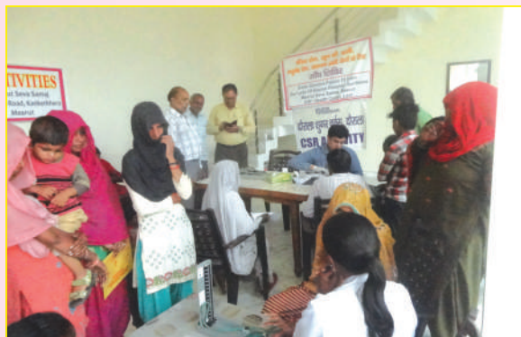
Health Camp at Surani

Networking and collaborating with Daurala Sugar Mill and Kripaon ki Mata Hospital, Sardhana, we have organized two health camps in Baparsi on 19th Feb 2020 and Surani village on 2nd April 2019. Nearly 640 people got benefitted from these camps. Health-check-ups were done by the doctor and advised to do proper diagnosis at hospitals, medicines were provided such as iron folic tablets, vitamin A tablets etc., free of cost for common diseases. 400 sanitary pads were distributed to adolescent girls and women in these camps.