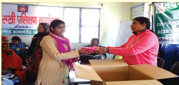
Distribution of Sanitary pads at Jani Health Camp

In Saharanpur district, people of Ramnagar were suffering from Diarrhea, Skin allergy and fever so we, with the close coordination of health department, organized a health camp in Ramnagar on 22 Jun 2019, in which 212 patients were checked and given free medicine to all of them.