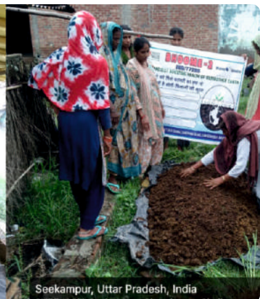
Seekampur, Uttar Pradesh, India